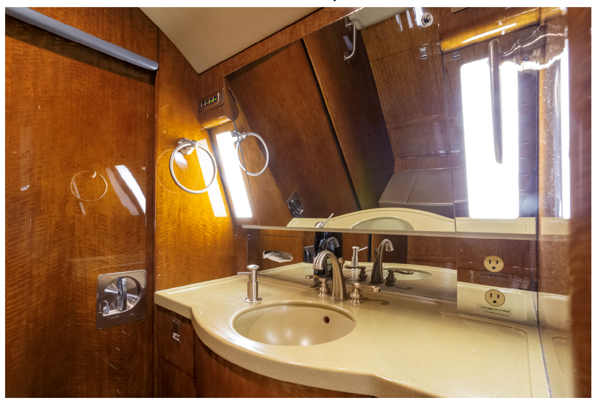
Aft Lavatory Sink