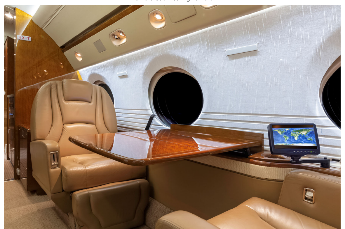
Aft Facing Club Seat