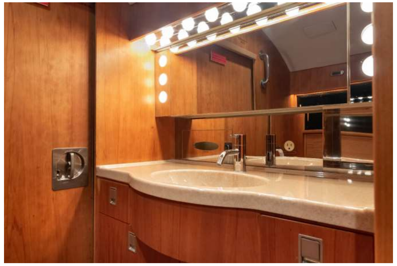
Aft Cabin Lavatory