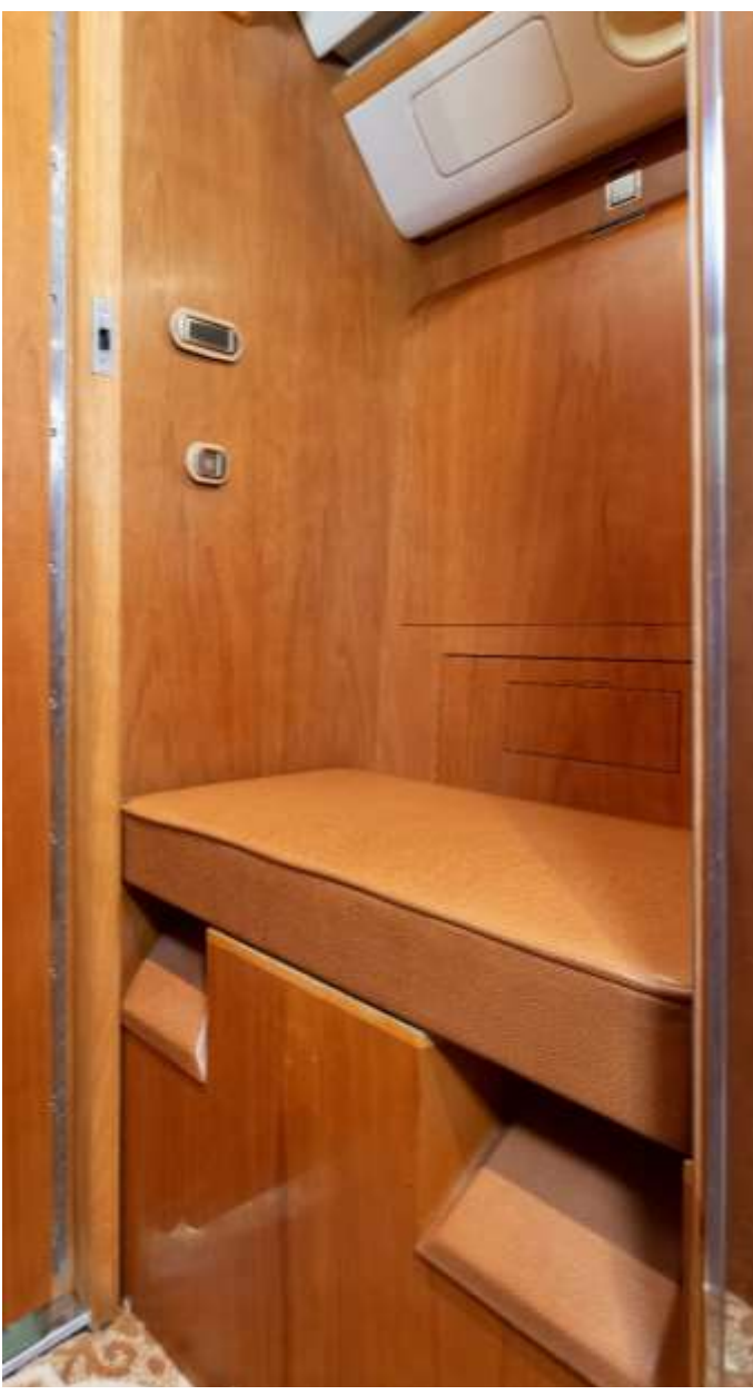
Forward Crew Rest