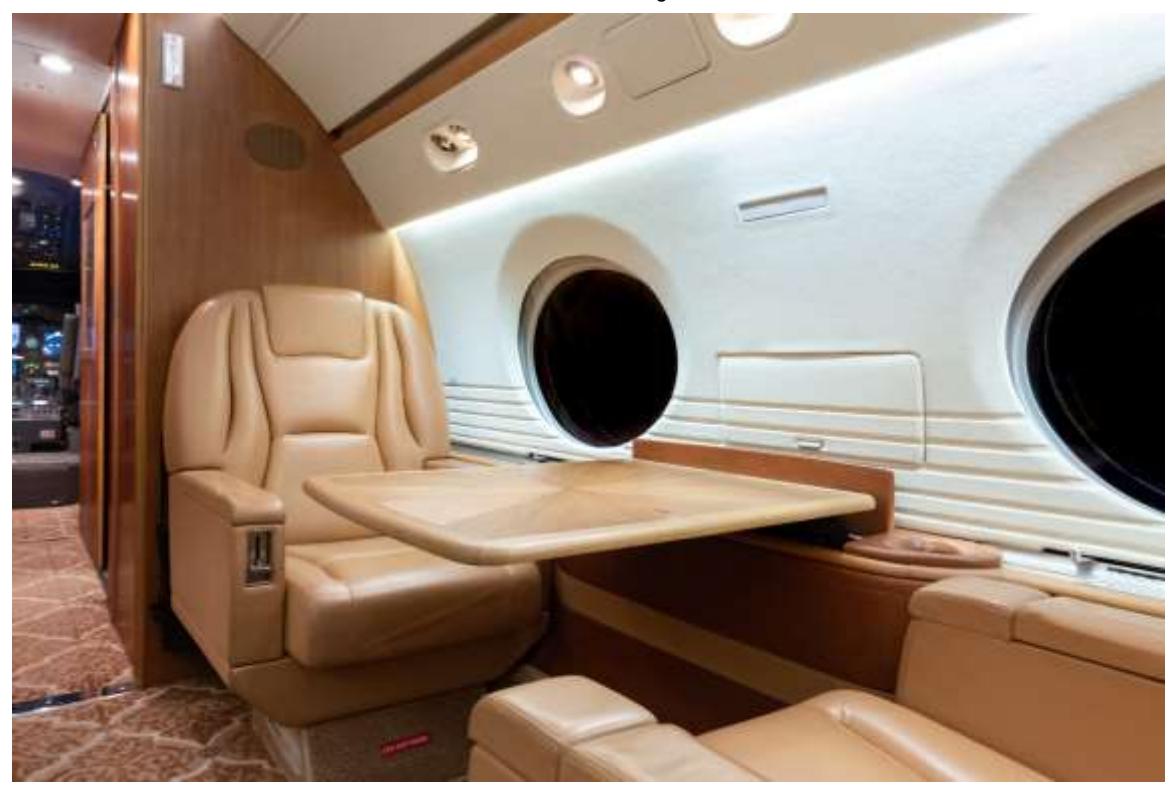
VIP Seat facing Forward