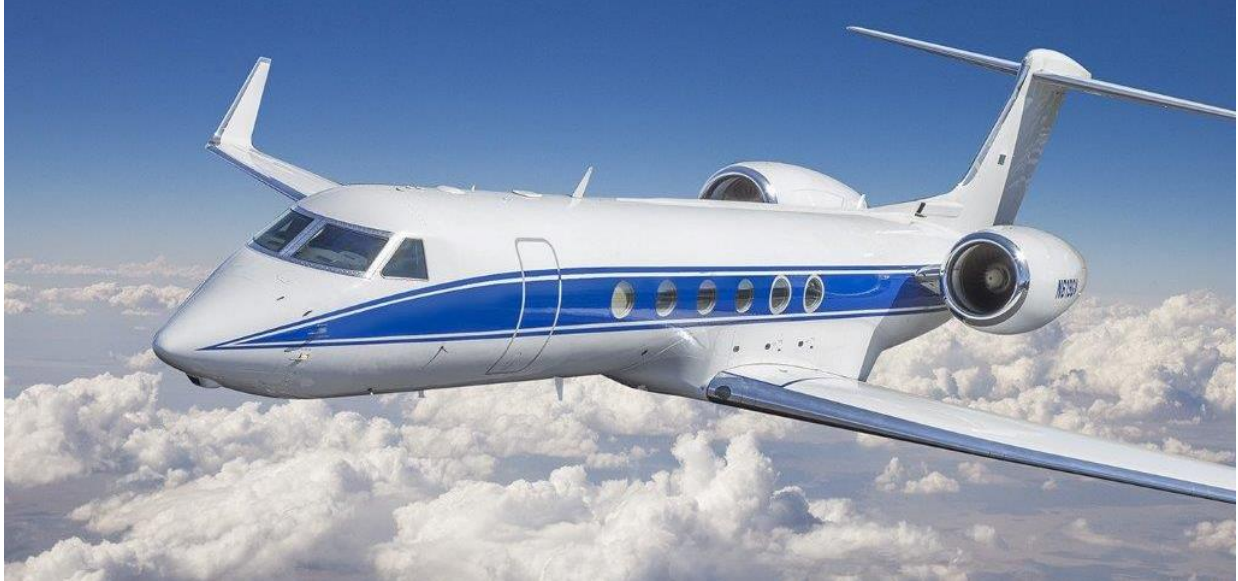
Overall White Exterior with Royal Blue Accent Stripe applied in January 2017.

Bold and graceful Gulfstream V Serial Number 619.