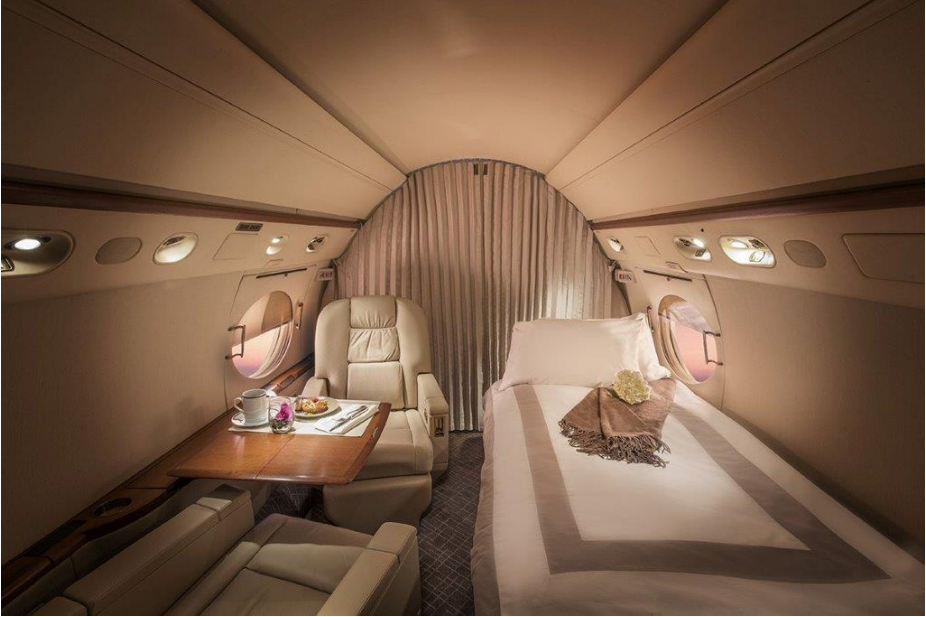
Full privacy for your trips overseas. Arrive rested and ready to go.