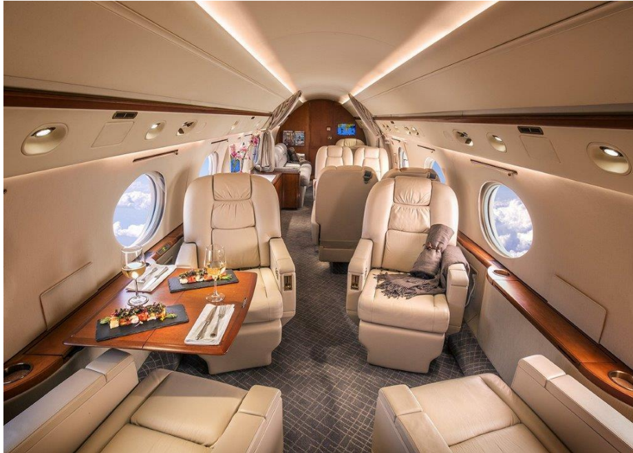
The 4-Place Forward Club is an ideal place to spend quality time with family or colleagues.

Perfect layout for business or pleasure.