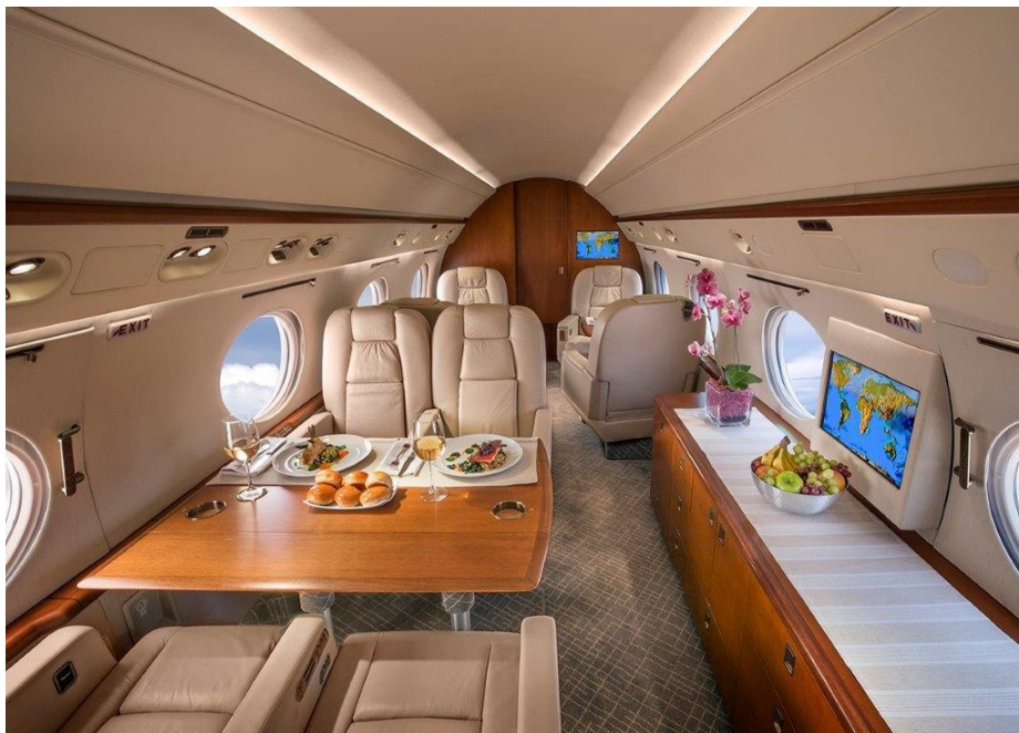
The mid cabin area is designed to enjoy a perfect gourmet dining experience at 47,000 feet.