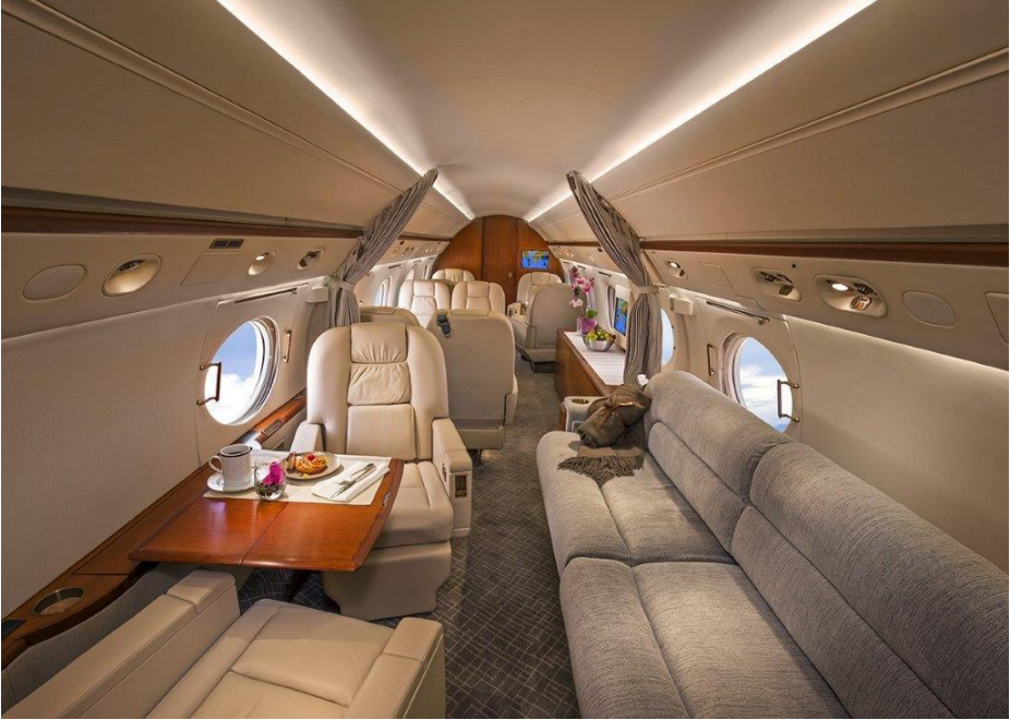
The Aft Cabin area is the perfect place to relax individually or with a group.