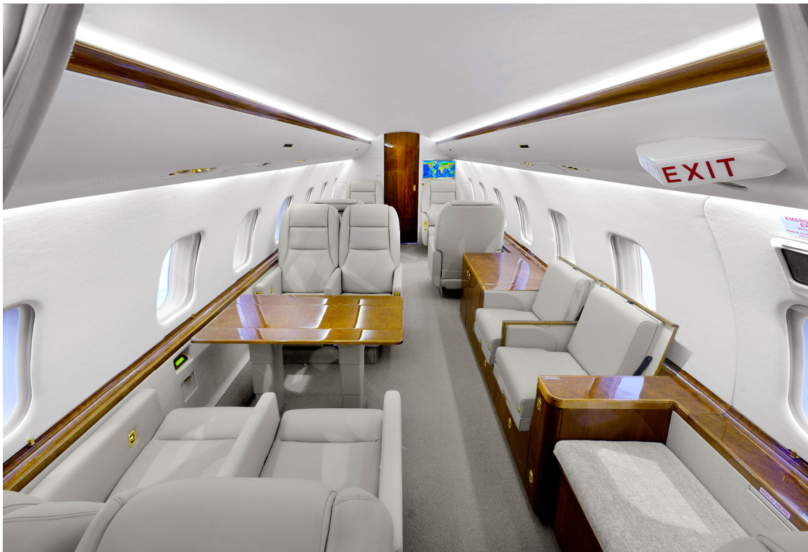
Mid Cabin Looking Forward with Dual Kibitzer Seats Open