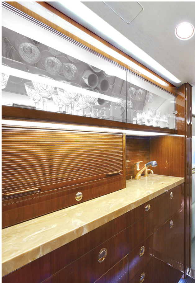
Right Side of Forward Galley