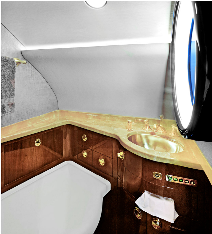
Forward Crew Lavatory