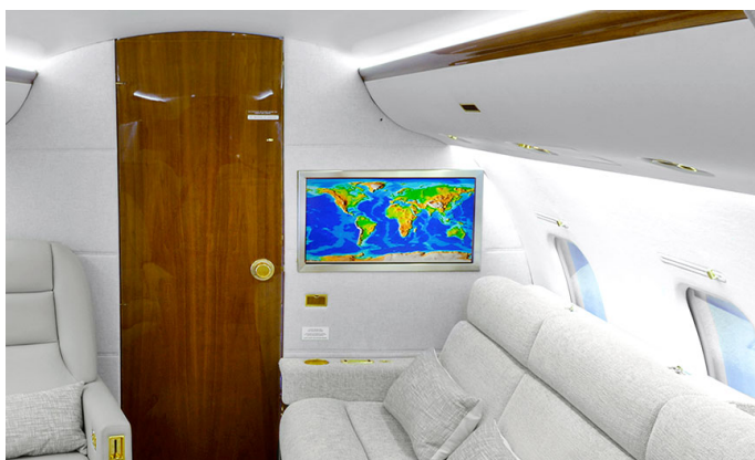
Aft 26" LCD Monitor