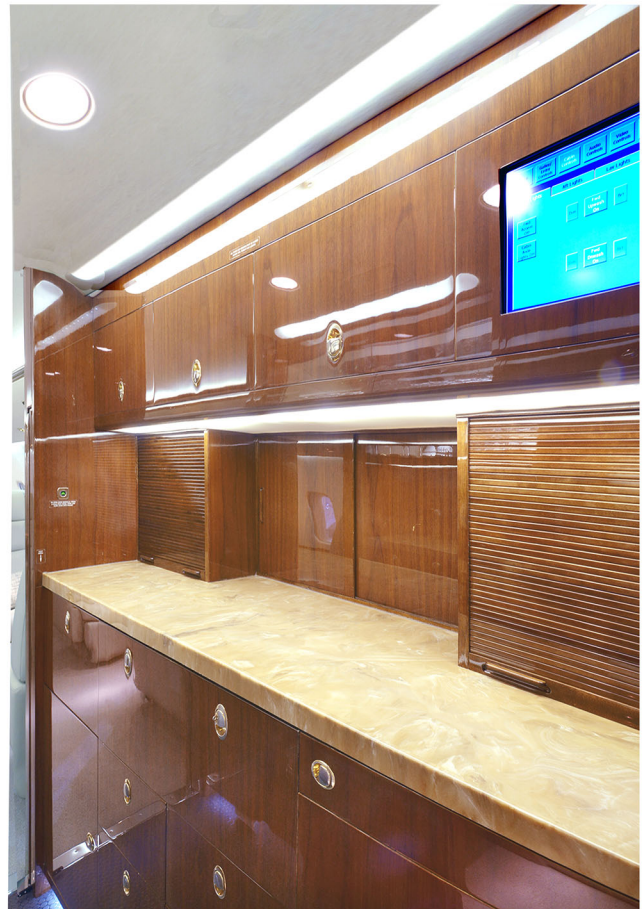
Left Side of Forward Galley