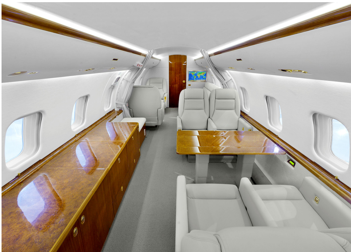
Mid Cabin Looking Aft with Dual Kibitzer Seats Closed