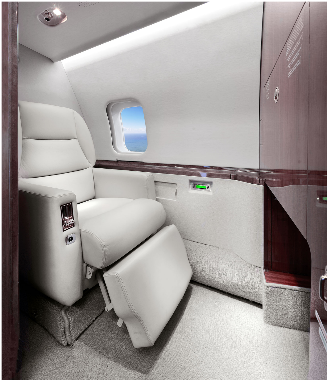
Forward Crew Rest