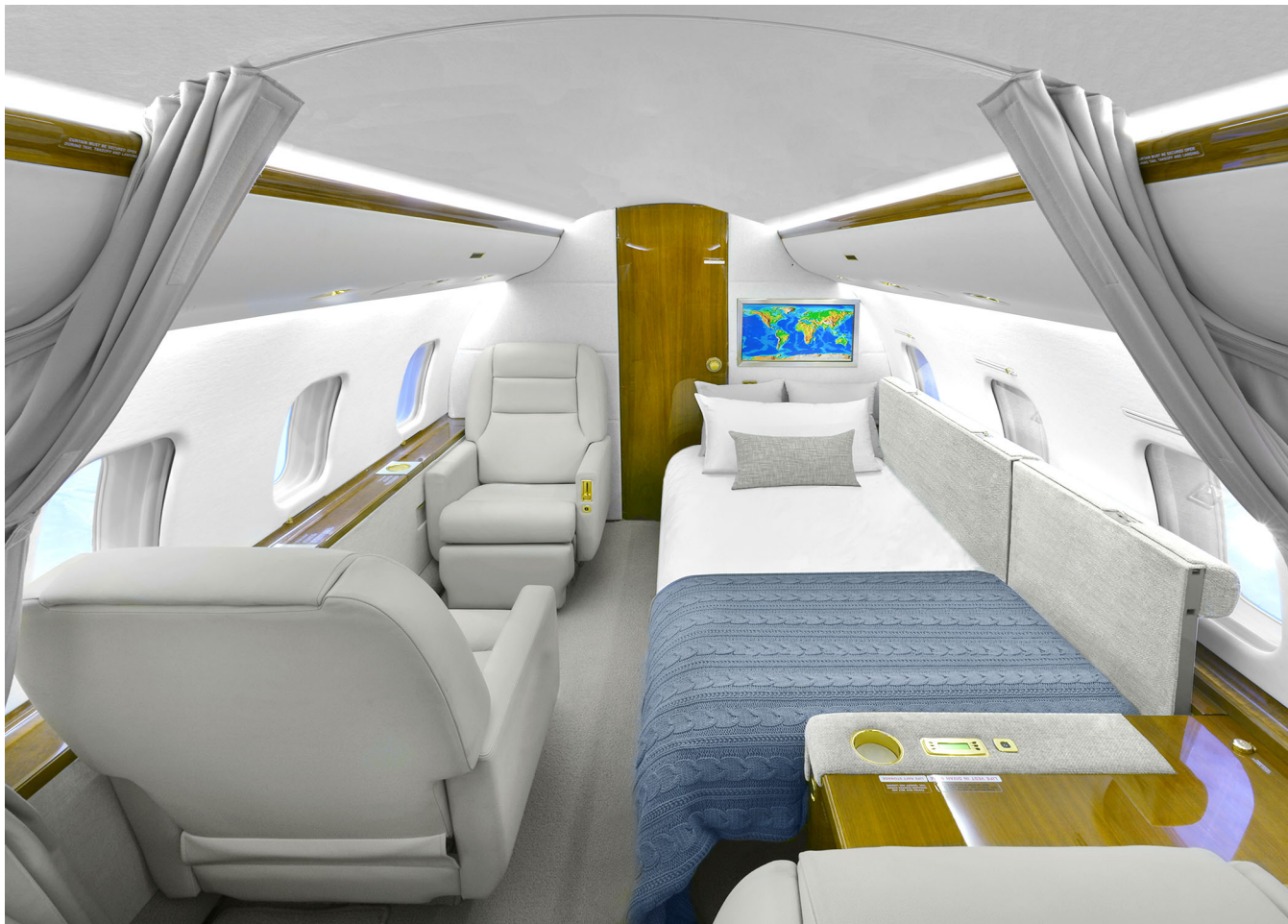
Aft Cabin with Berthable Divan