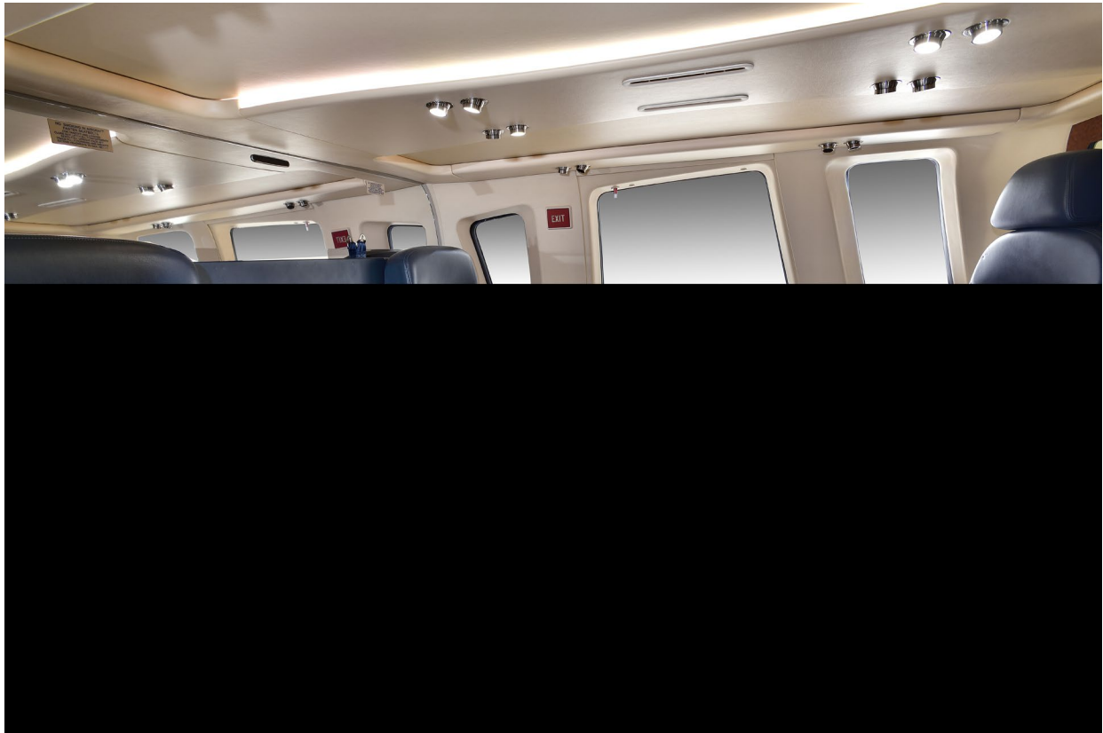
5 Seats Configuration