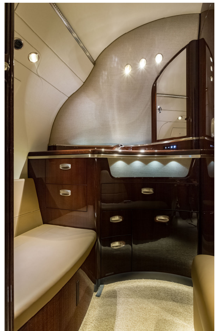
Forward Galley Aft Lavatory