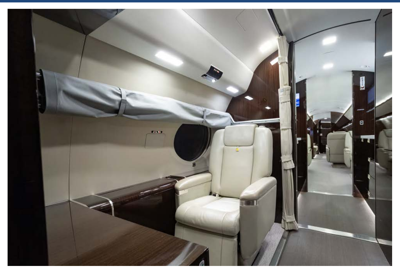
Forward Crew Rest