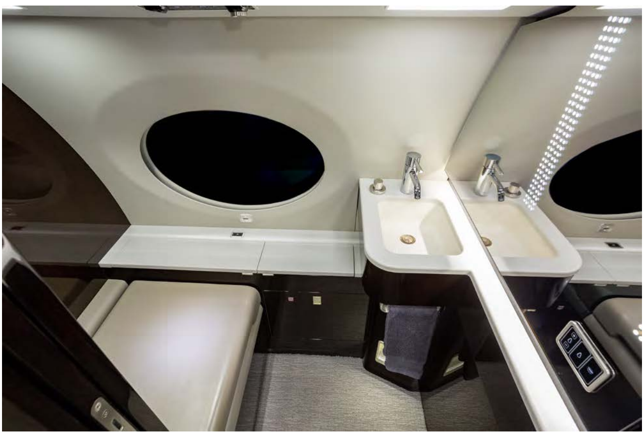
Forward Crew Lav