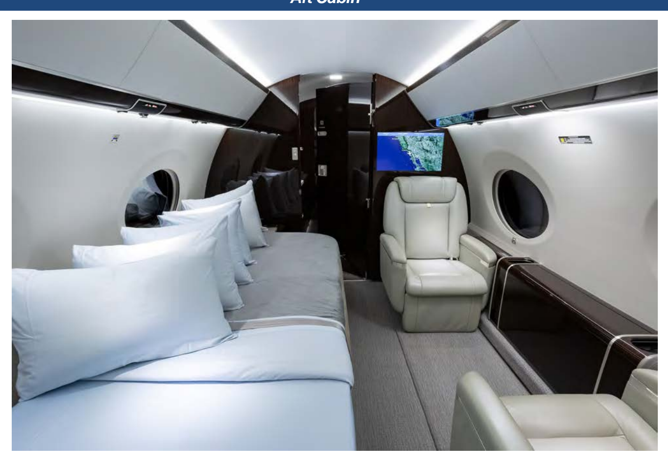
Aft Cabin looking Aft