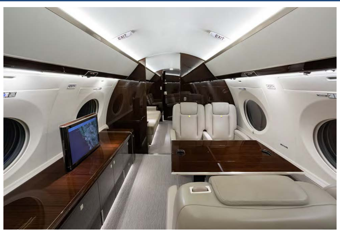
Mid Cabin looking Aft