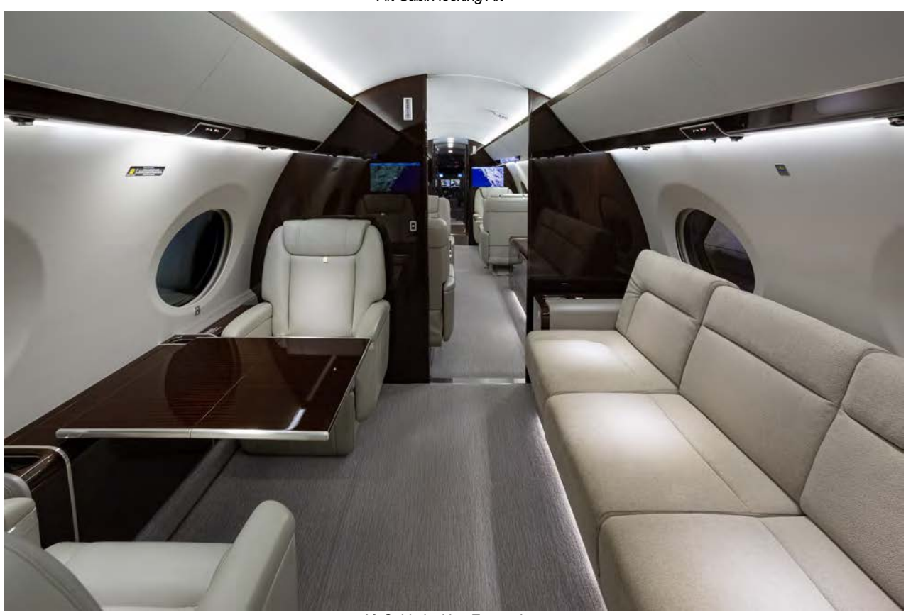
Aft Cabin looking Forward