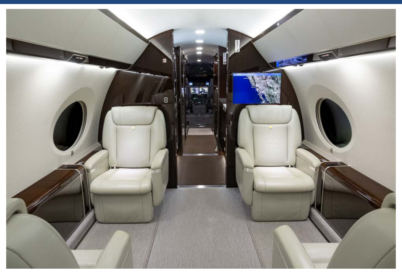
Forward Cabin looking Forward