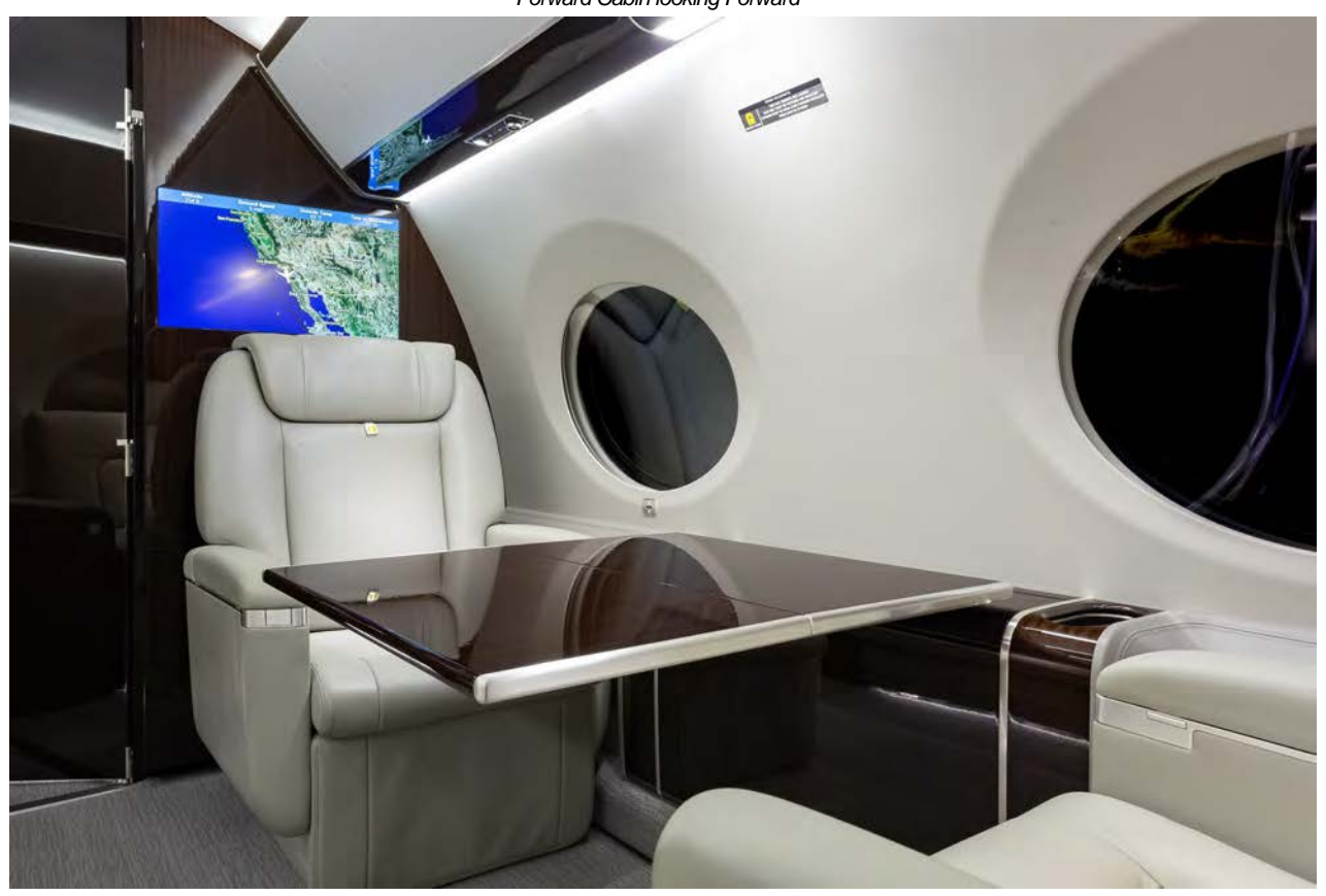
Forward VIP Seat (Both left and right-side seats have VIP control panels)