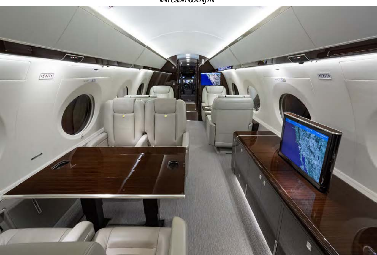
Mid Cabin looking Forward