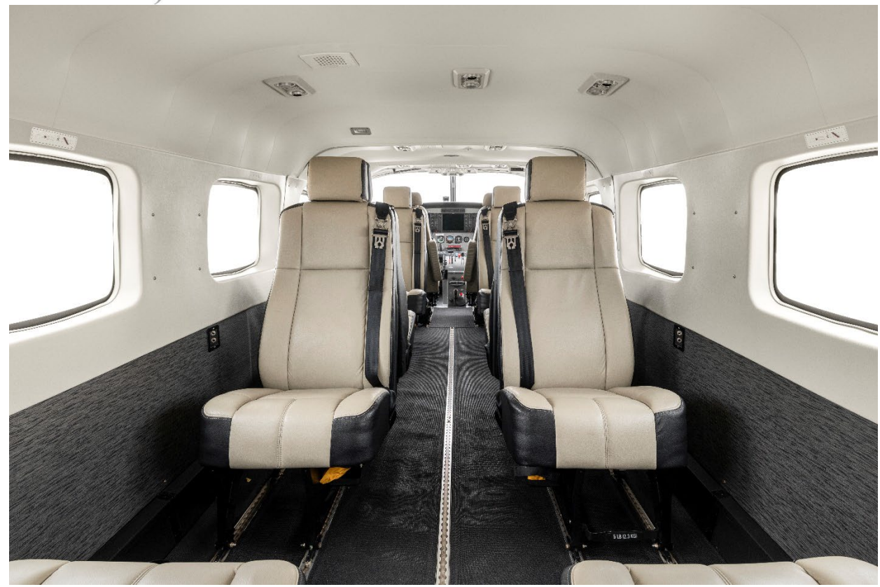
Aft Cabin Looking Fwd