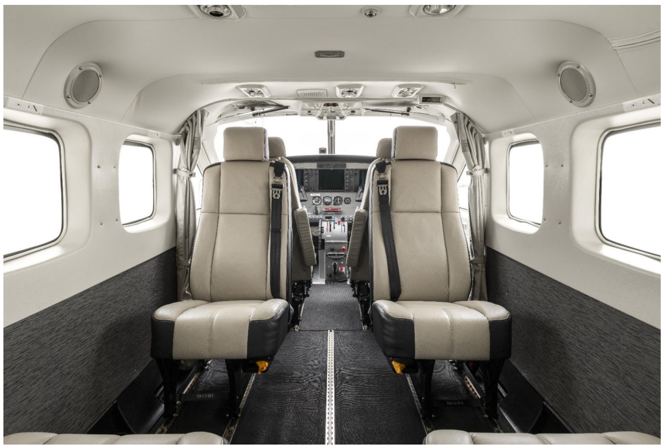
Fwd Cabin Looking Fwd