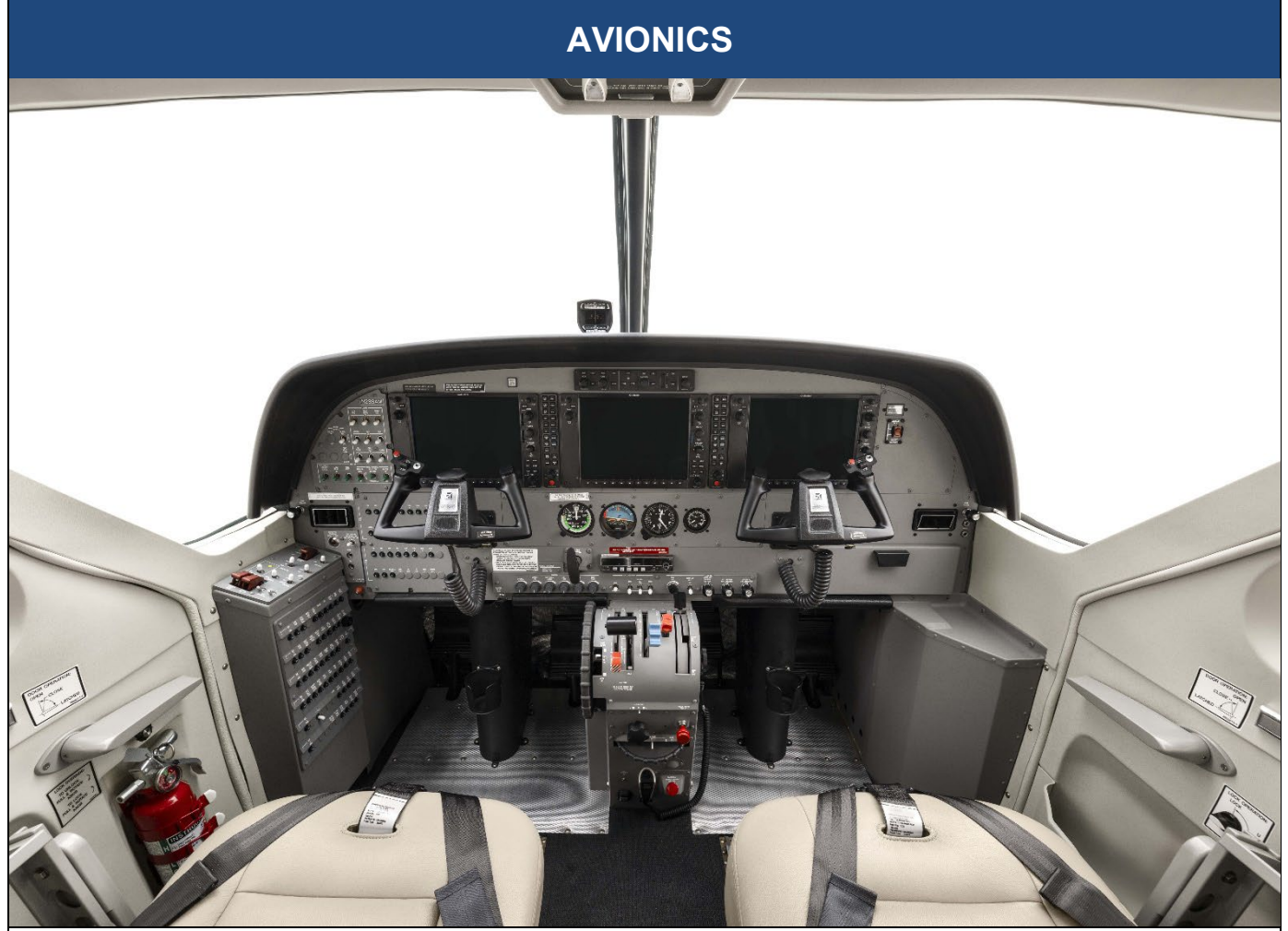
Avionics: Garmin G1000® NXi Suite