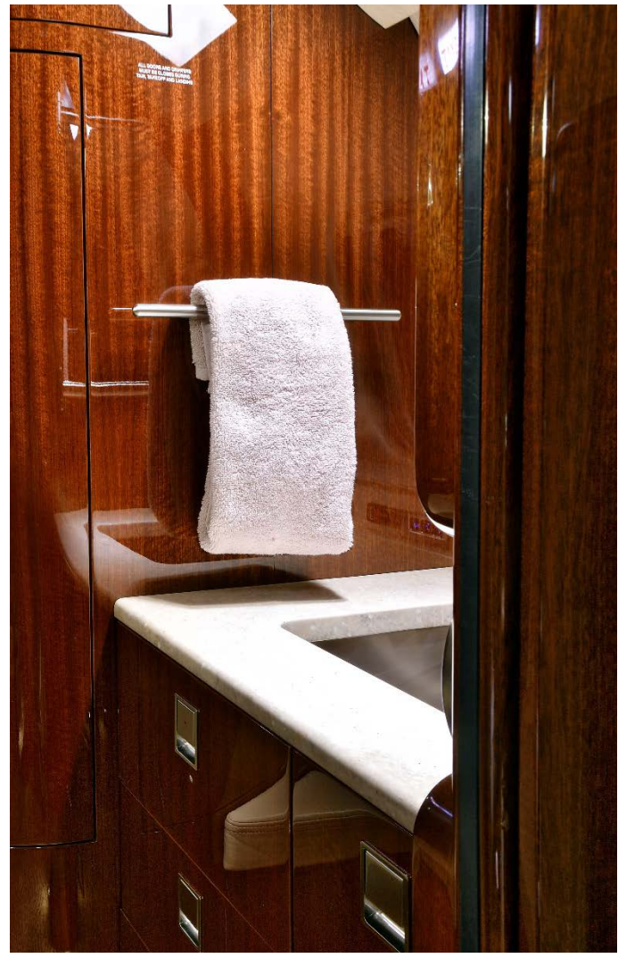
Forward Refreshment Center