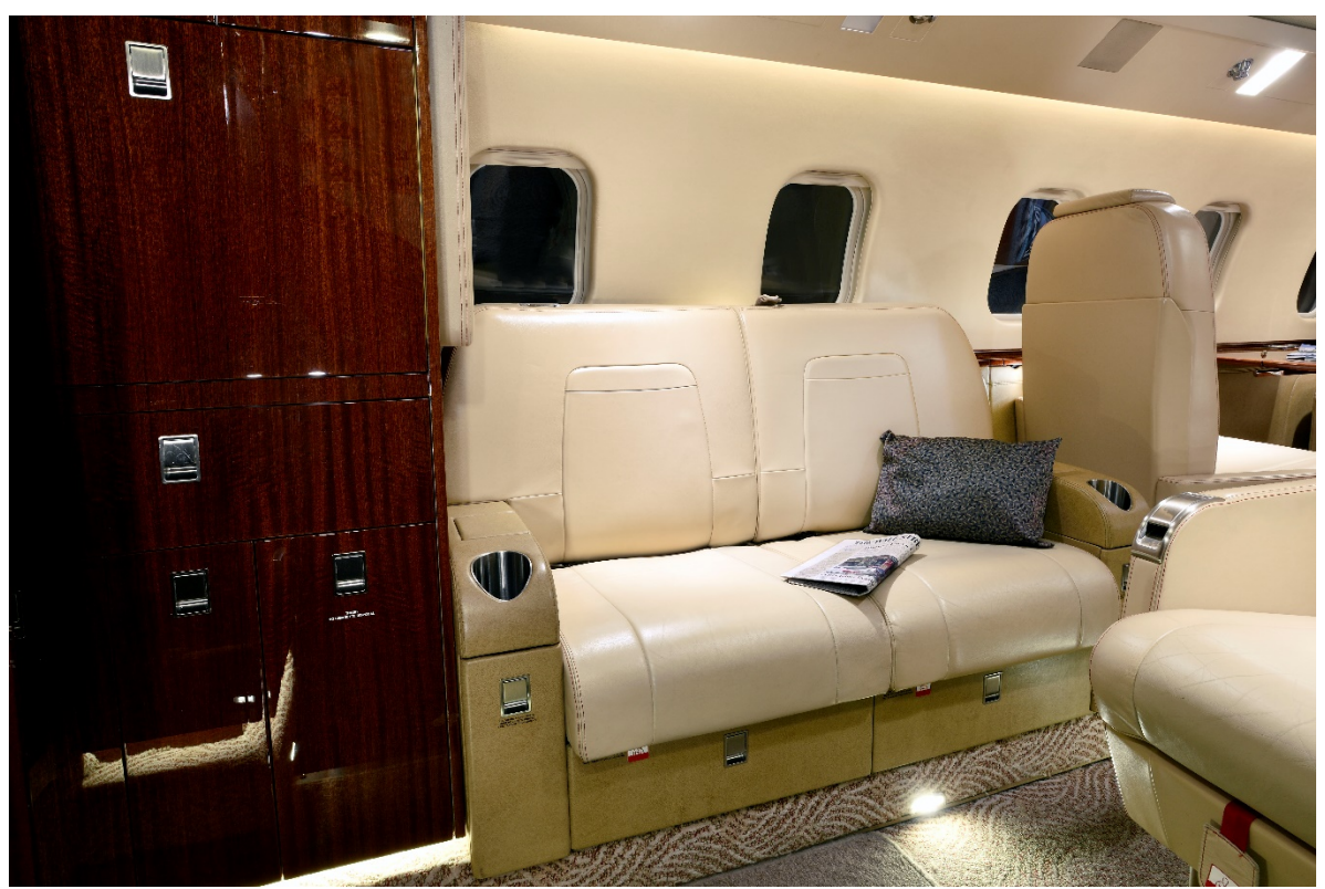
Forward Cabin From the Entrance Door