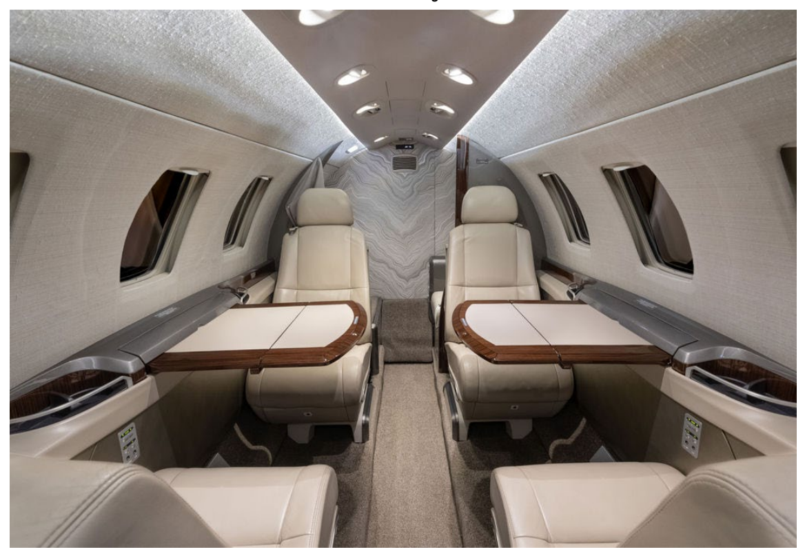
Cabin looking Aft