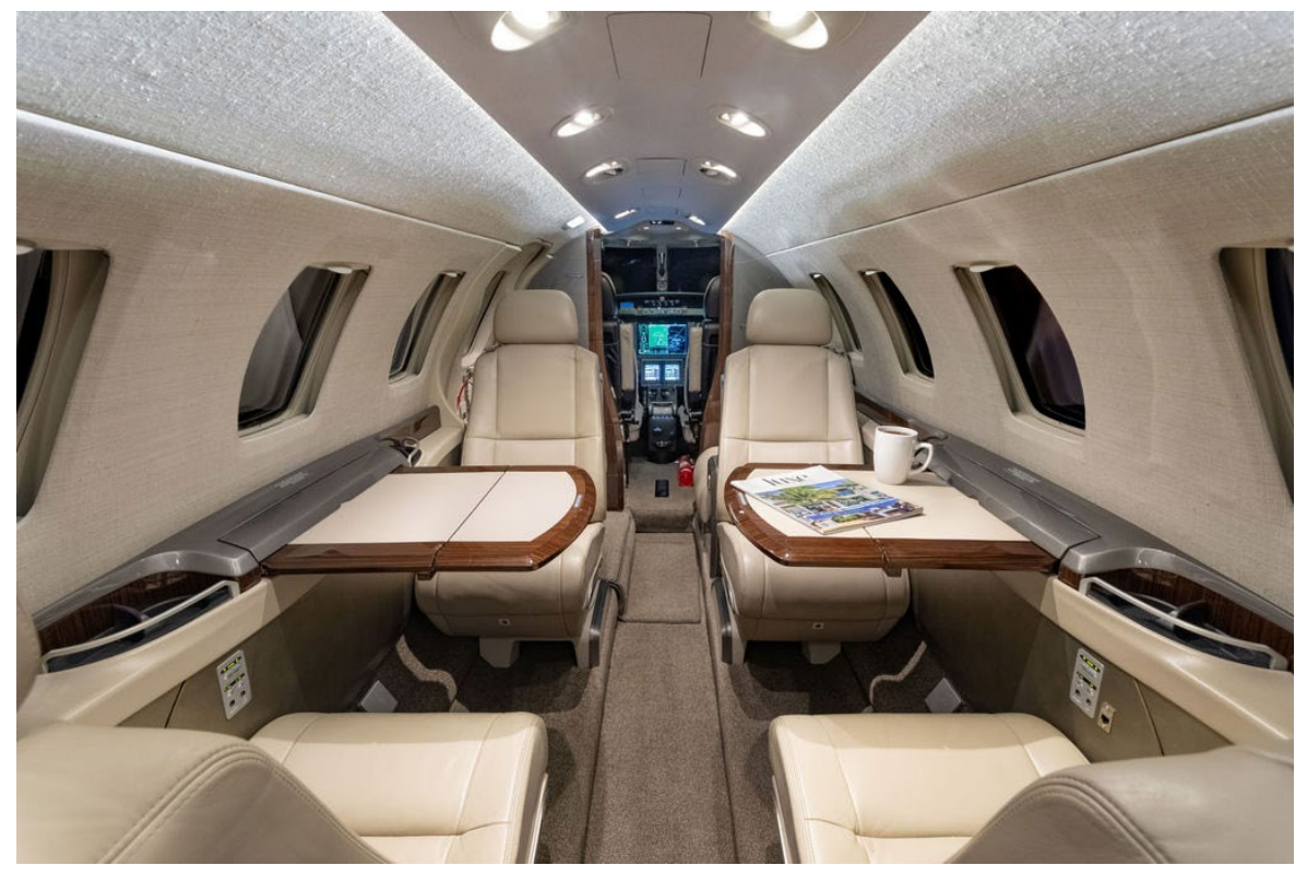
Cabin looking FWD