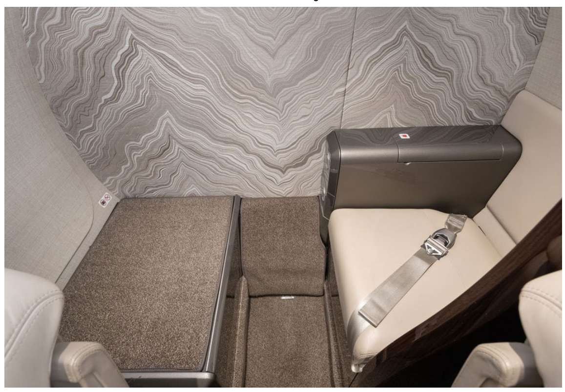
AFT Belted Lavatory