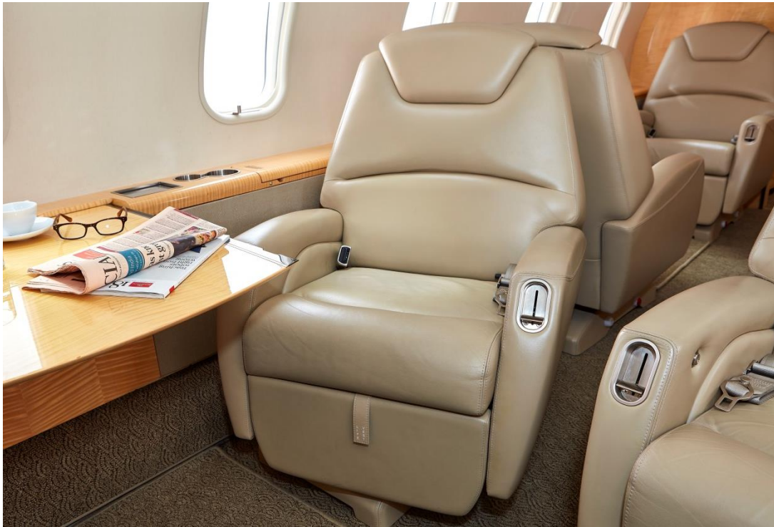
Right-Hand Forward Facing Seat