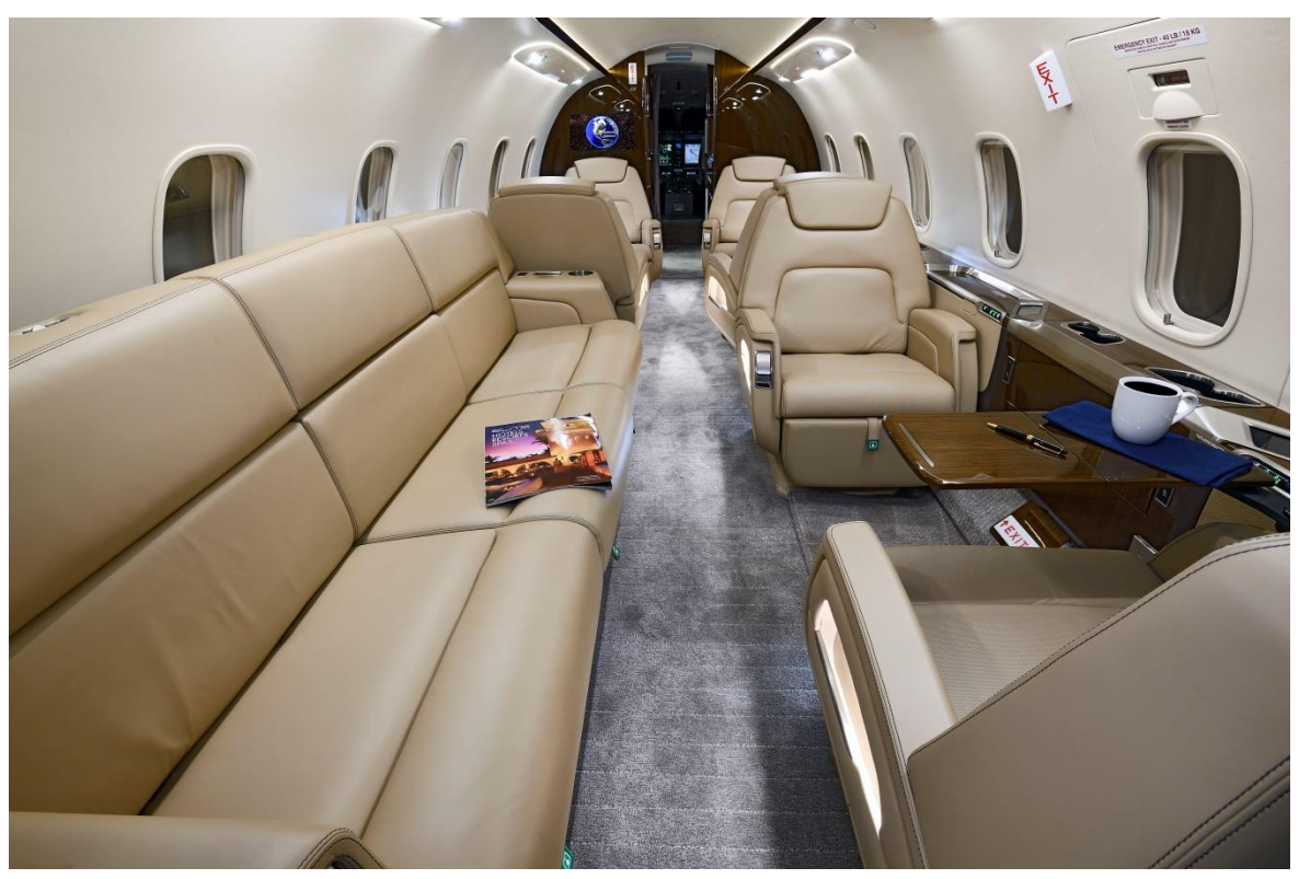
Aft Cabin looking Forward