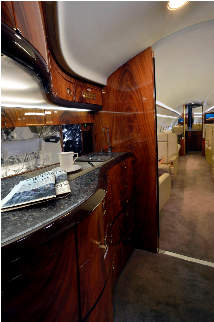
Forward "S" Shaped Galley