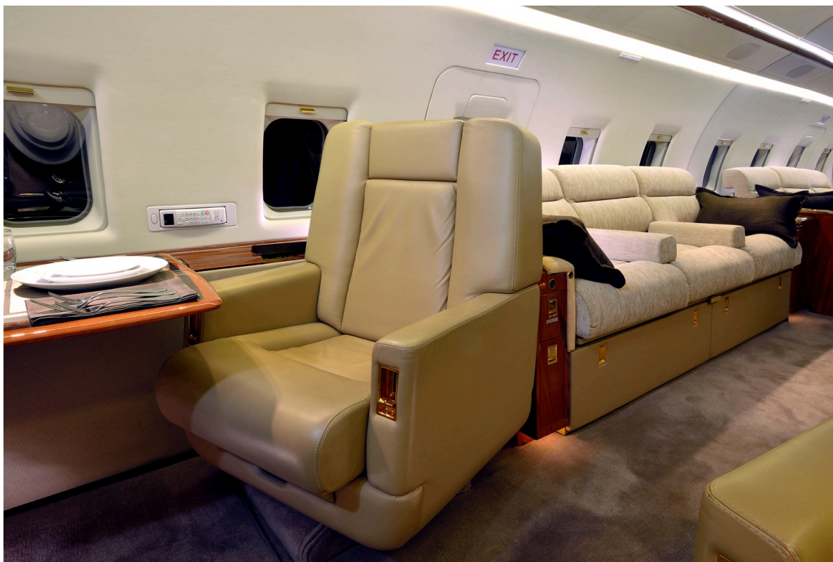
Right Hand Seat Facing Forward