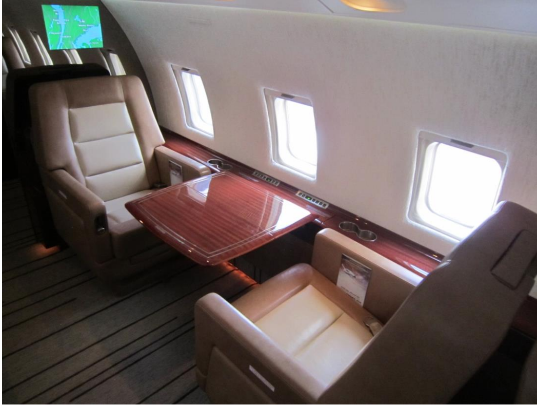
Right Hand Seat Looking Forward