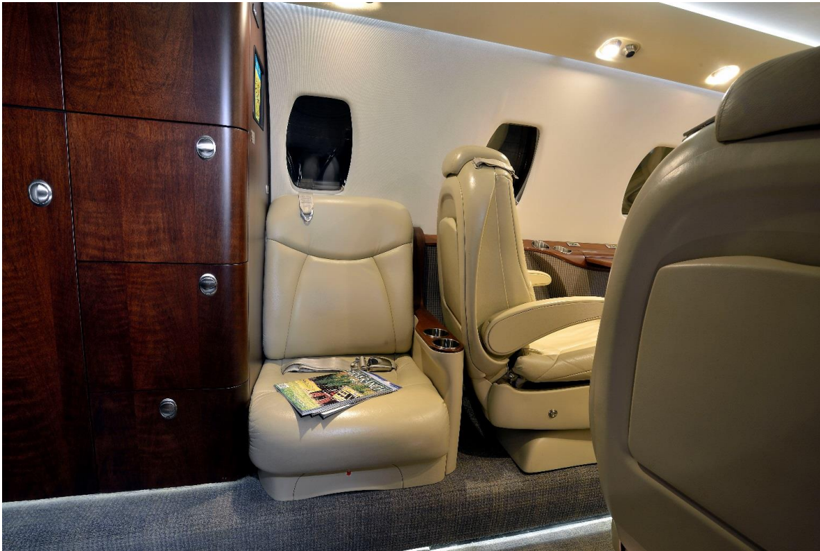
Single Seat which faces the Main Entry Door