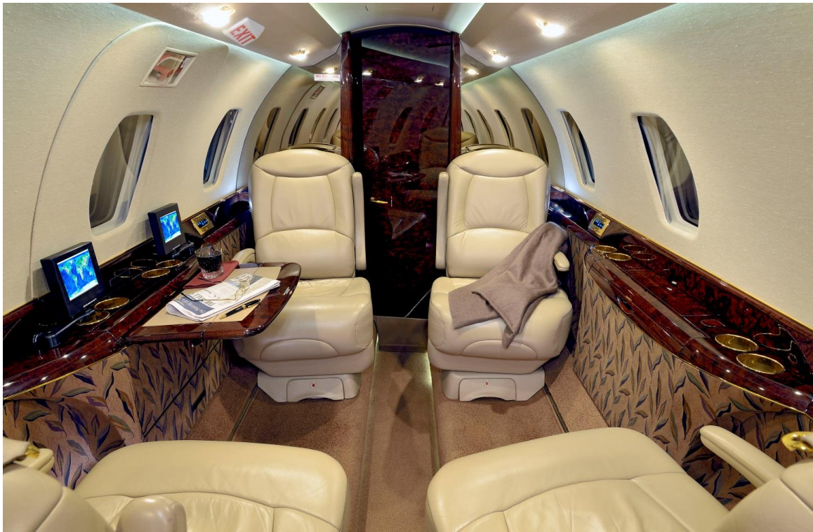
Aft Cabin looking Aft