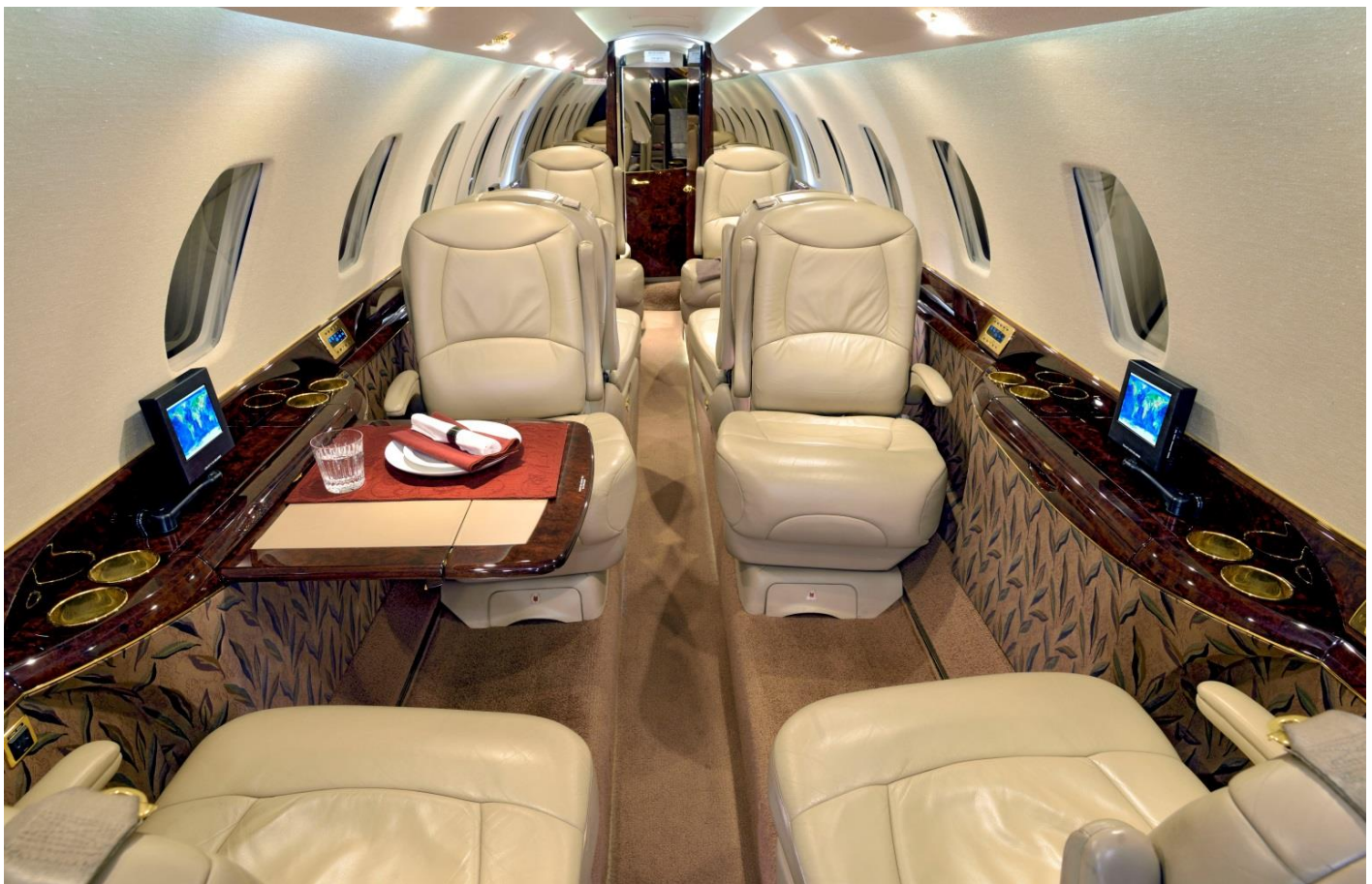
Forward Cabin looking Aft