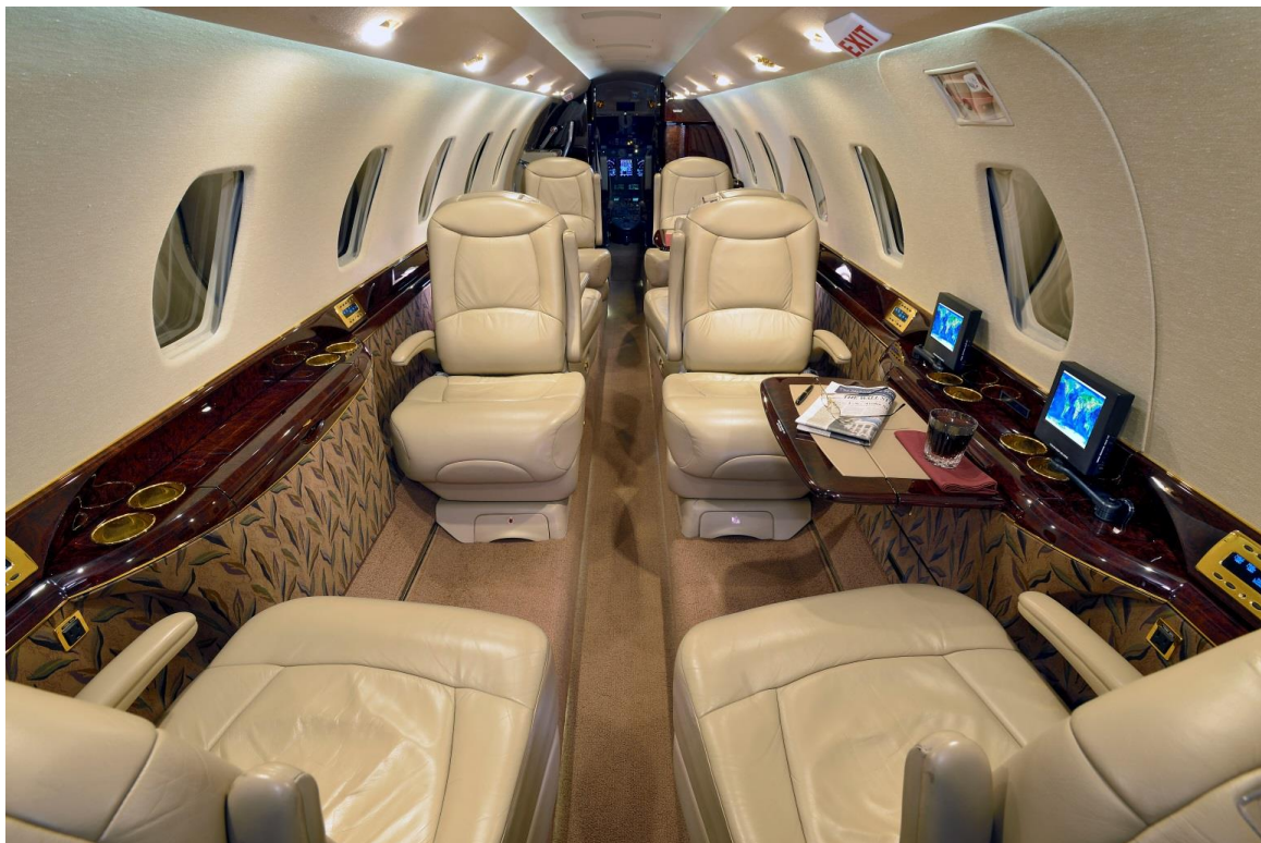
Aft Cabin looking Forward