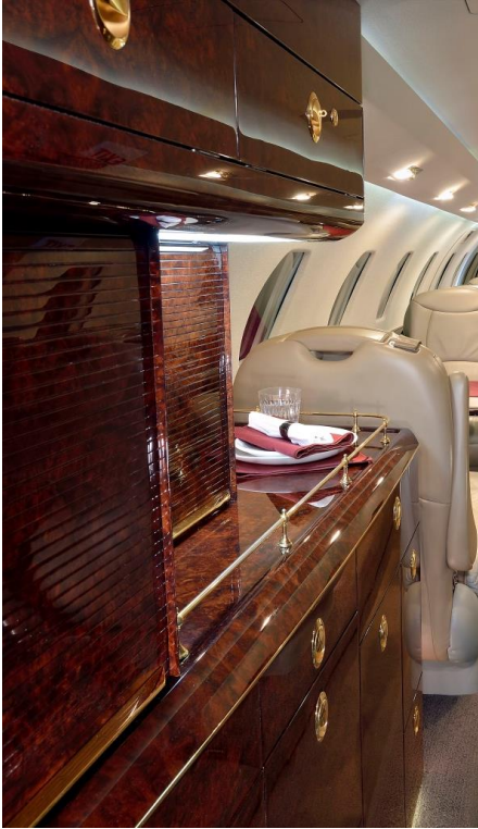
Forward Galley looking Aft