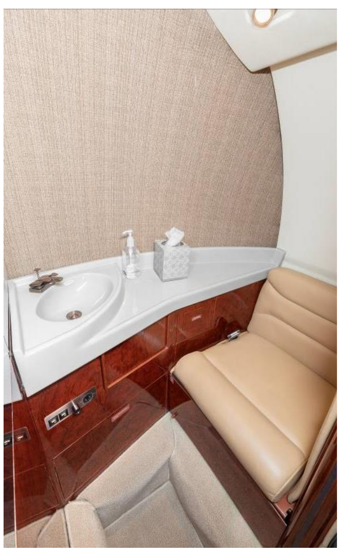
Left Hand Refreshment Center