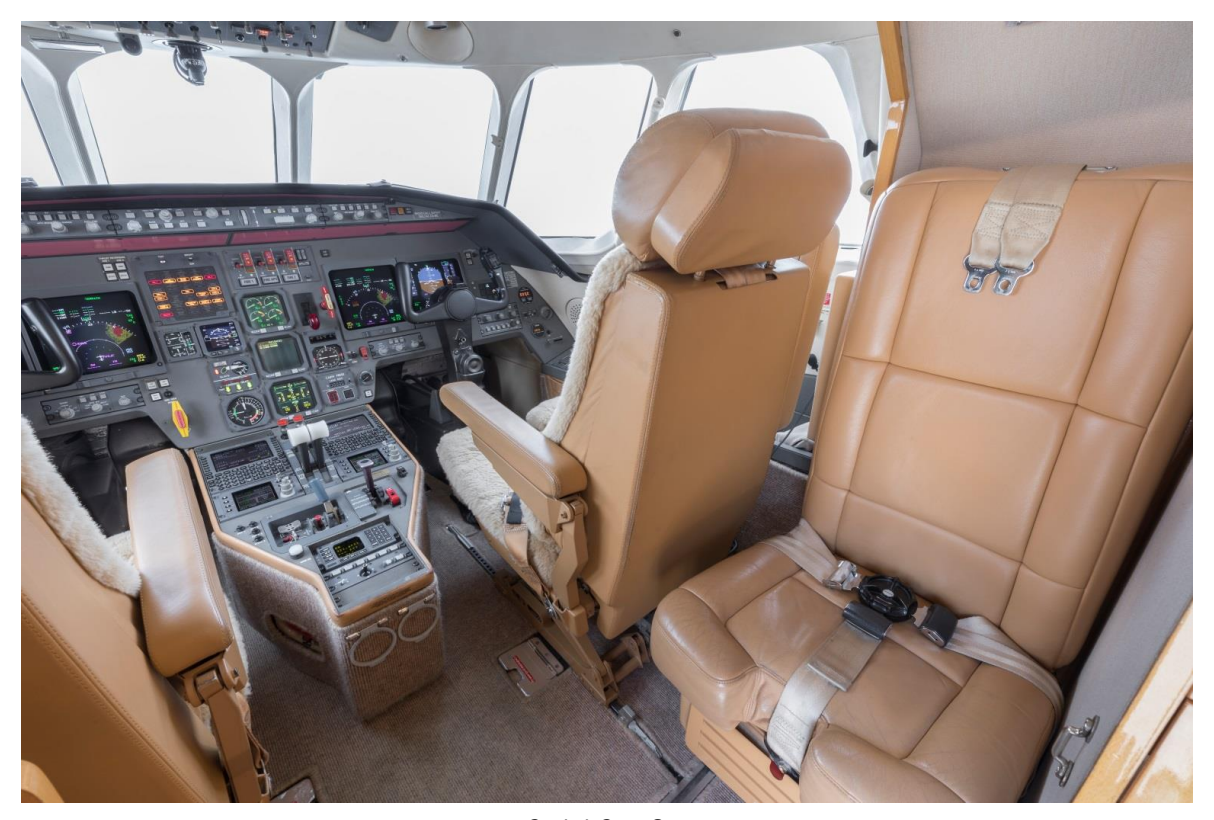
Cockpit Crew Seat