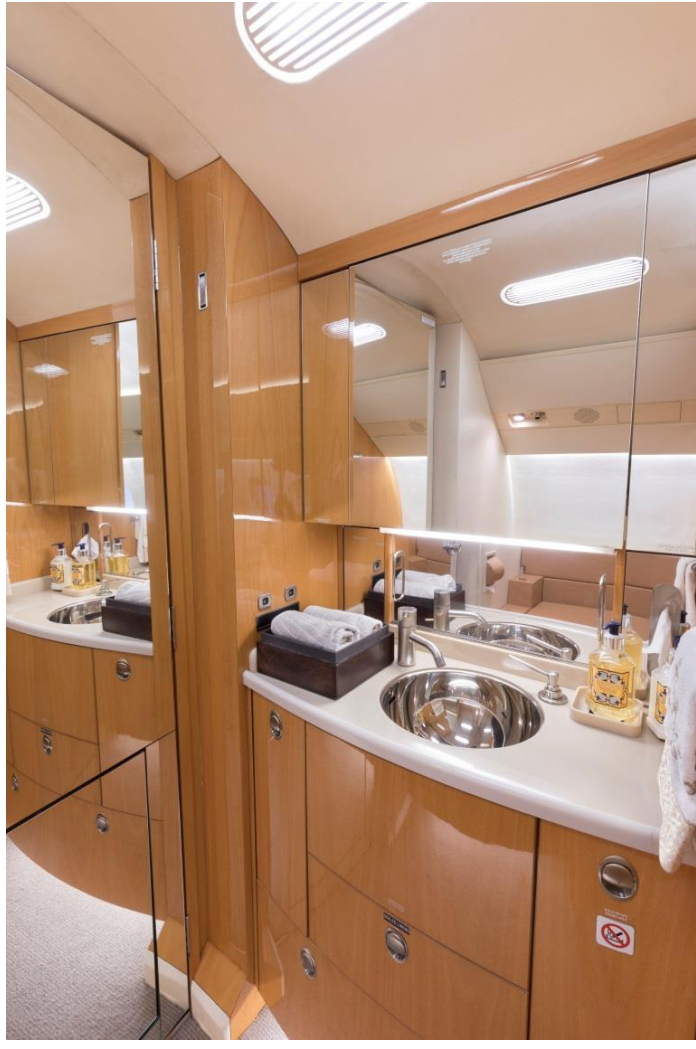
Forward Galley Aft Lavatory