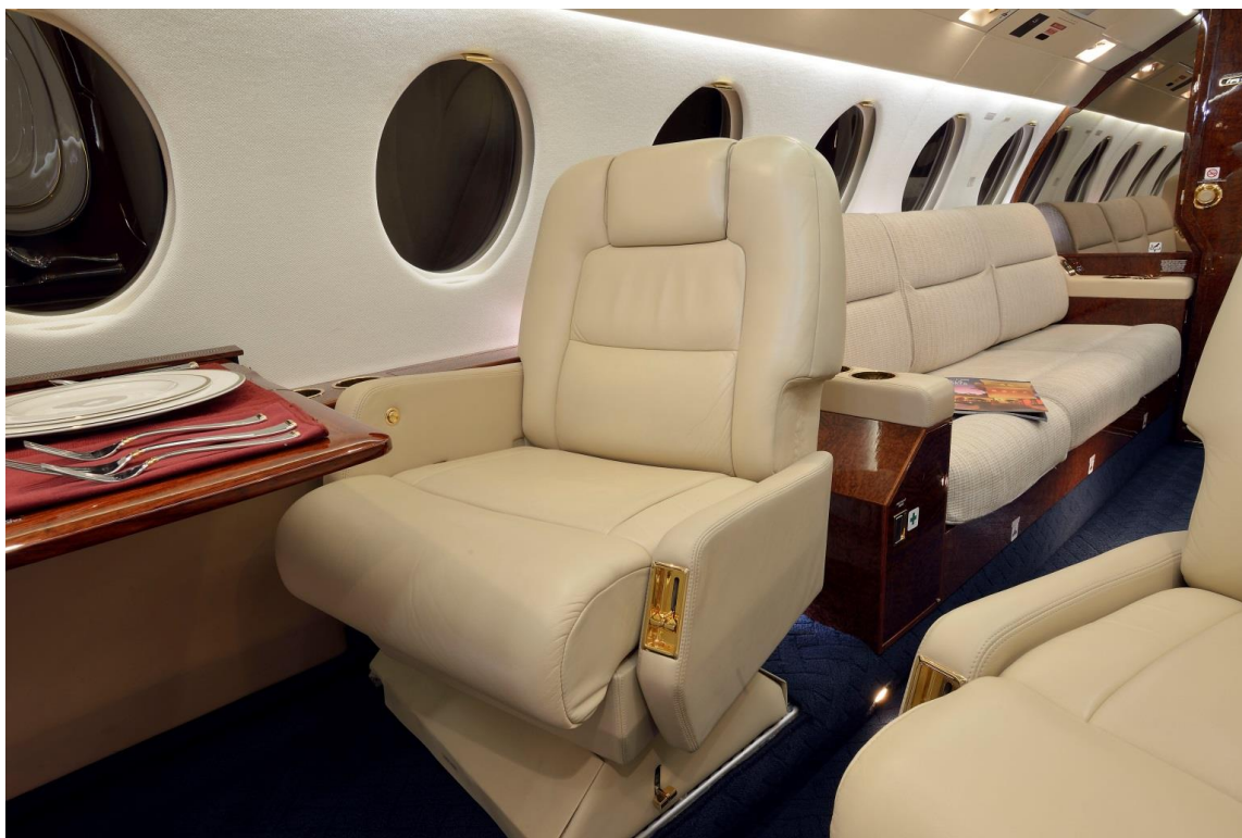
Right Hand seat looking Forward