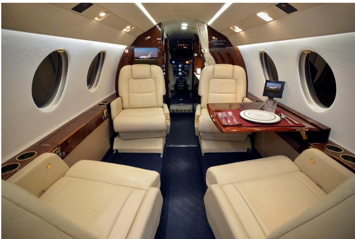
Forward Cabin looking Forward