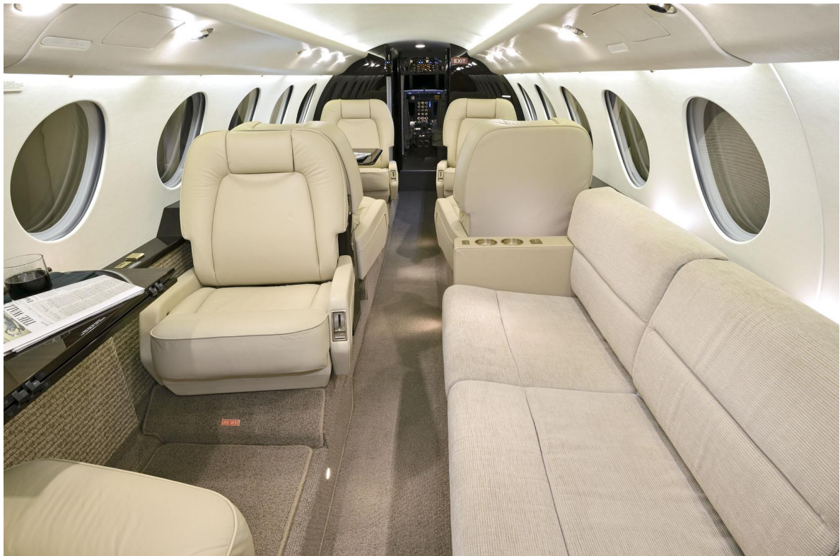
Aft Cabin looking Fwd