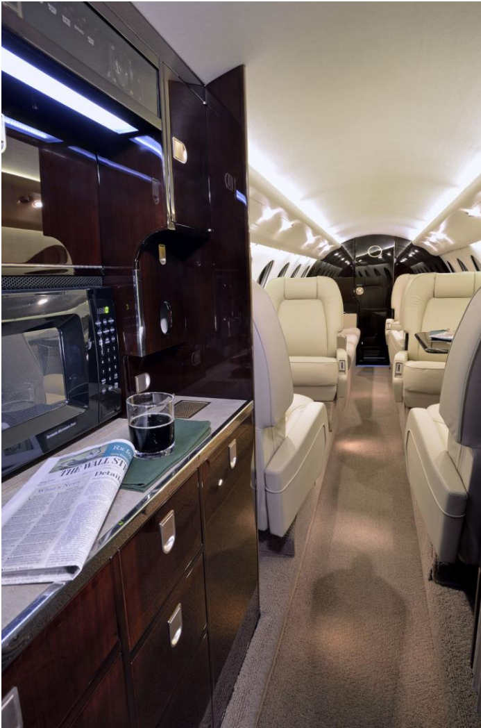
Fwd Galley Looking Aft