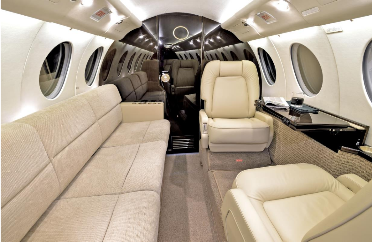
L/H Side Aft Cabin looking Aft