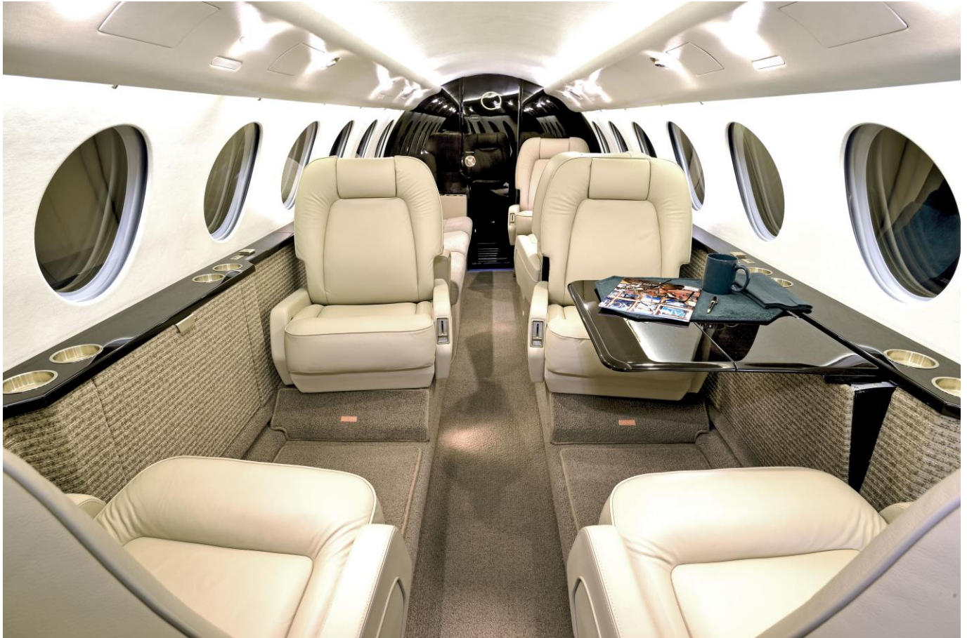
Fwd Cabin looking Aft