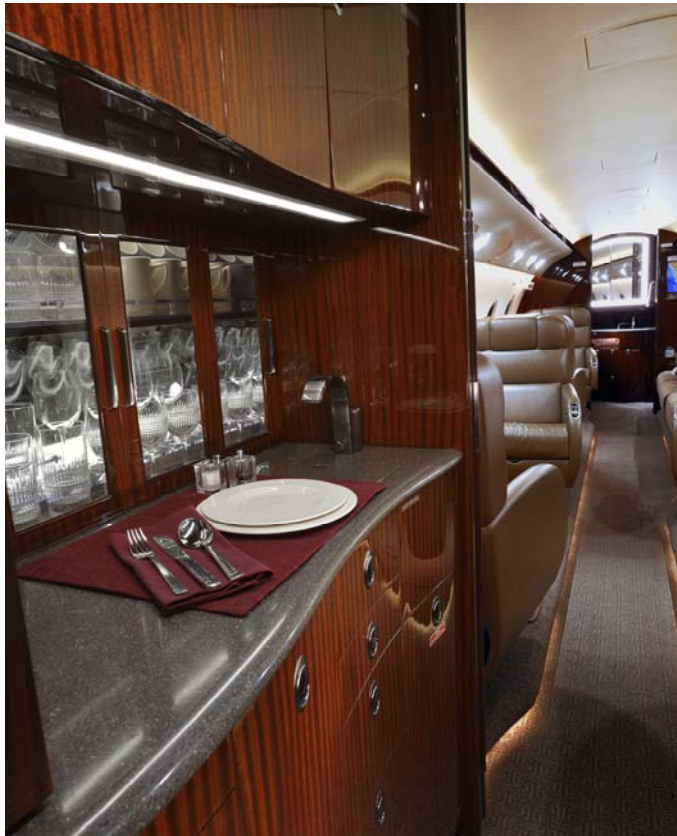
Forward Galley looking forward