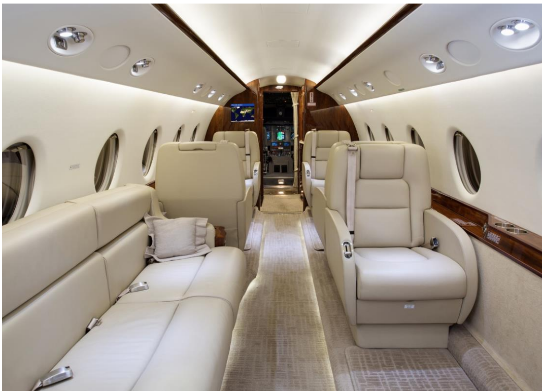
Aft Cabin looking Forward