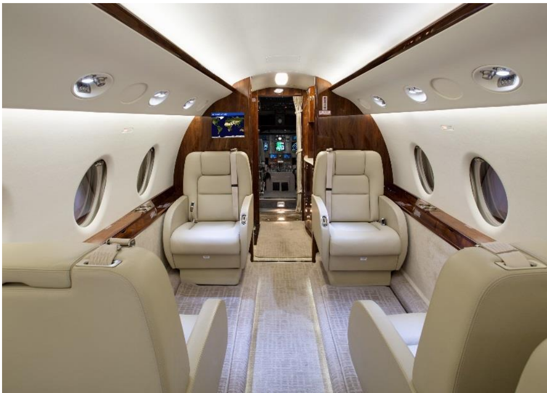
Forward Cabin looking Forward