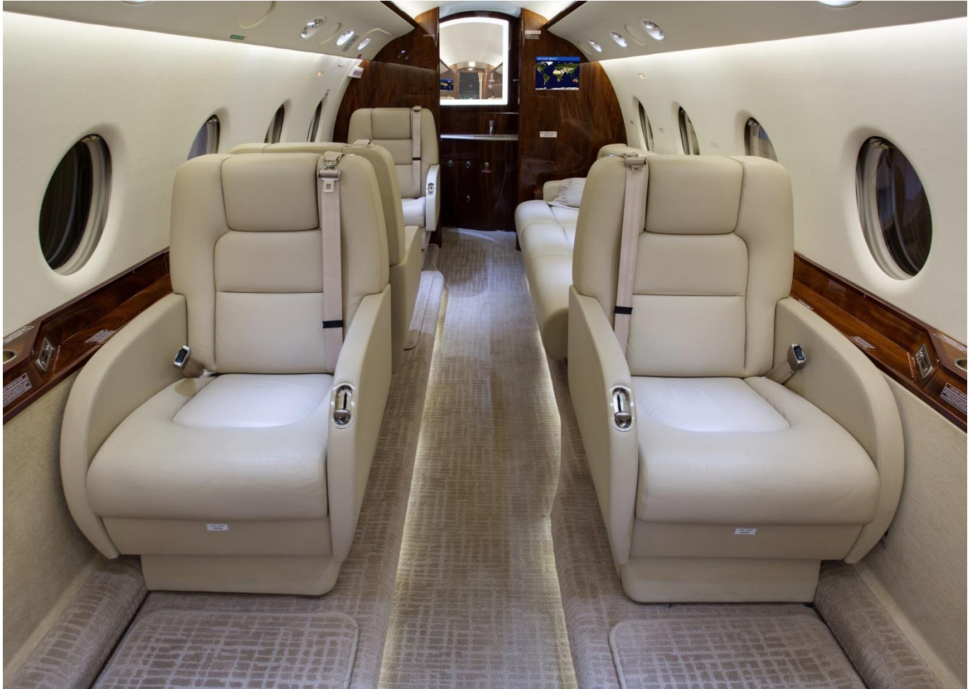
Forward Cabin looking Aft

This 9 passenger executive cabin interior is configured with a four-place forward club and aft divan across from a two-place club. There is a forward galley, aft private lavatory and folding tables between each club setting.