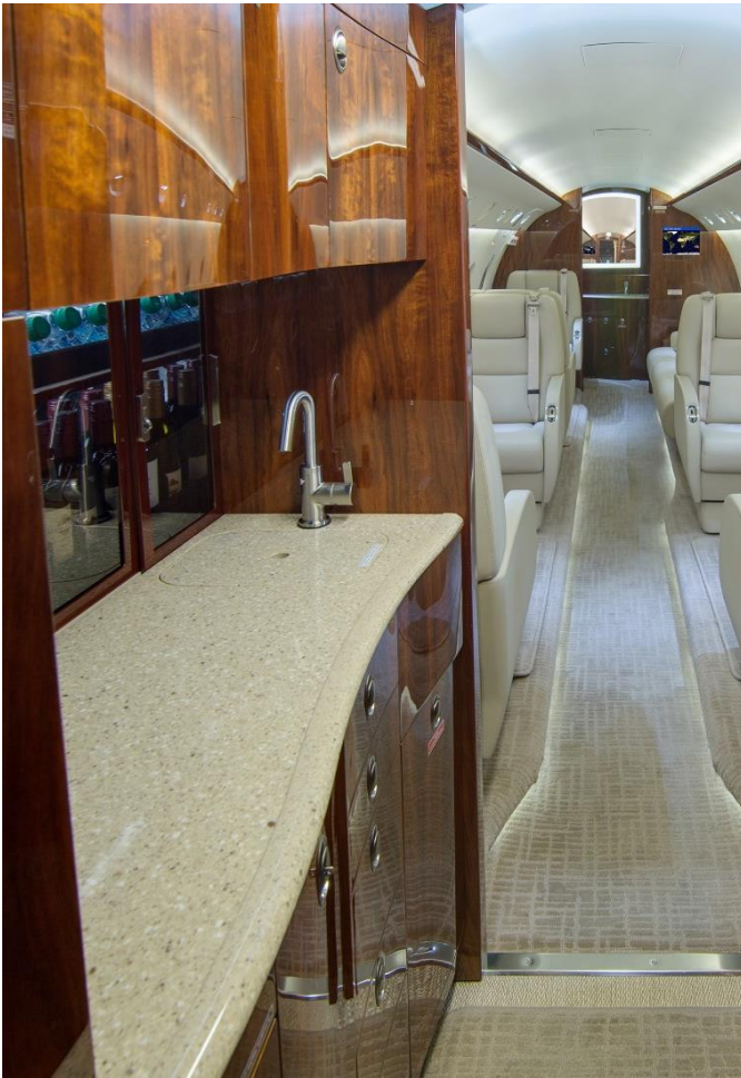
Forward Galley looking aft