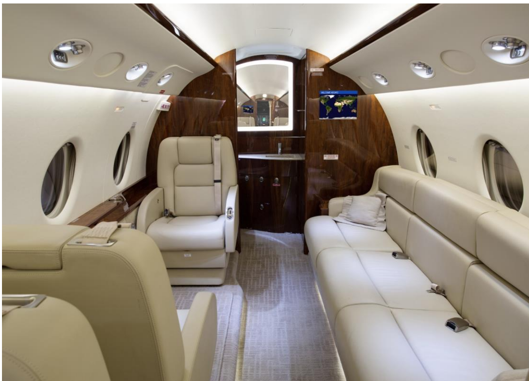
Aft Cabin looking Aft