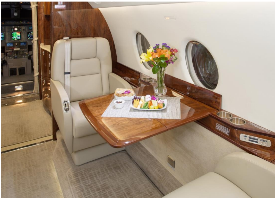
Right Hand Seat Facing Aft