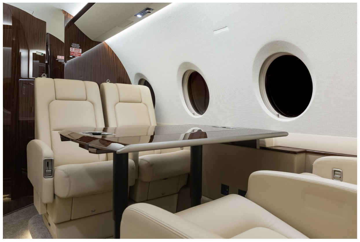
Aft Conference Group