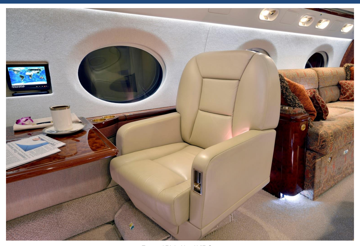
Forward Right Hand VIP Seat