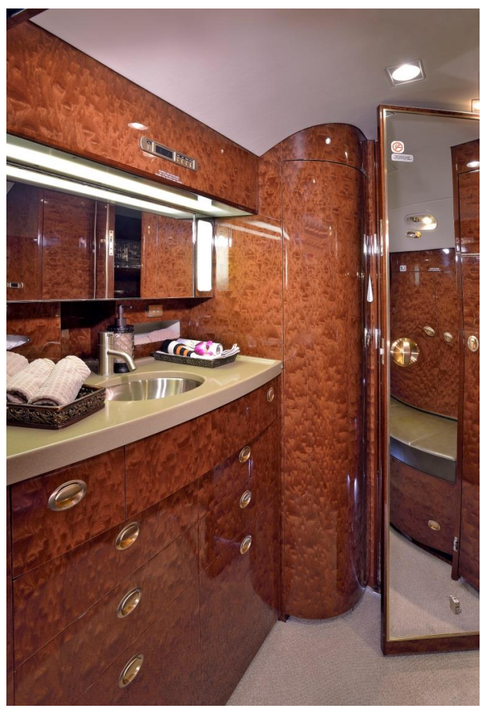
Aft Galley looking forward