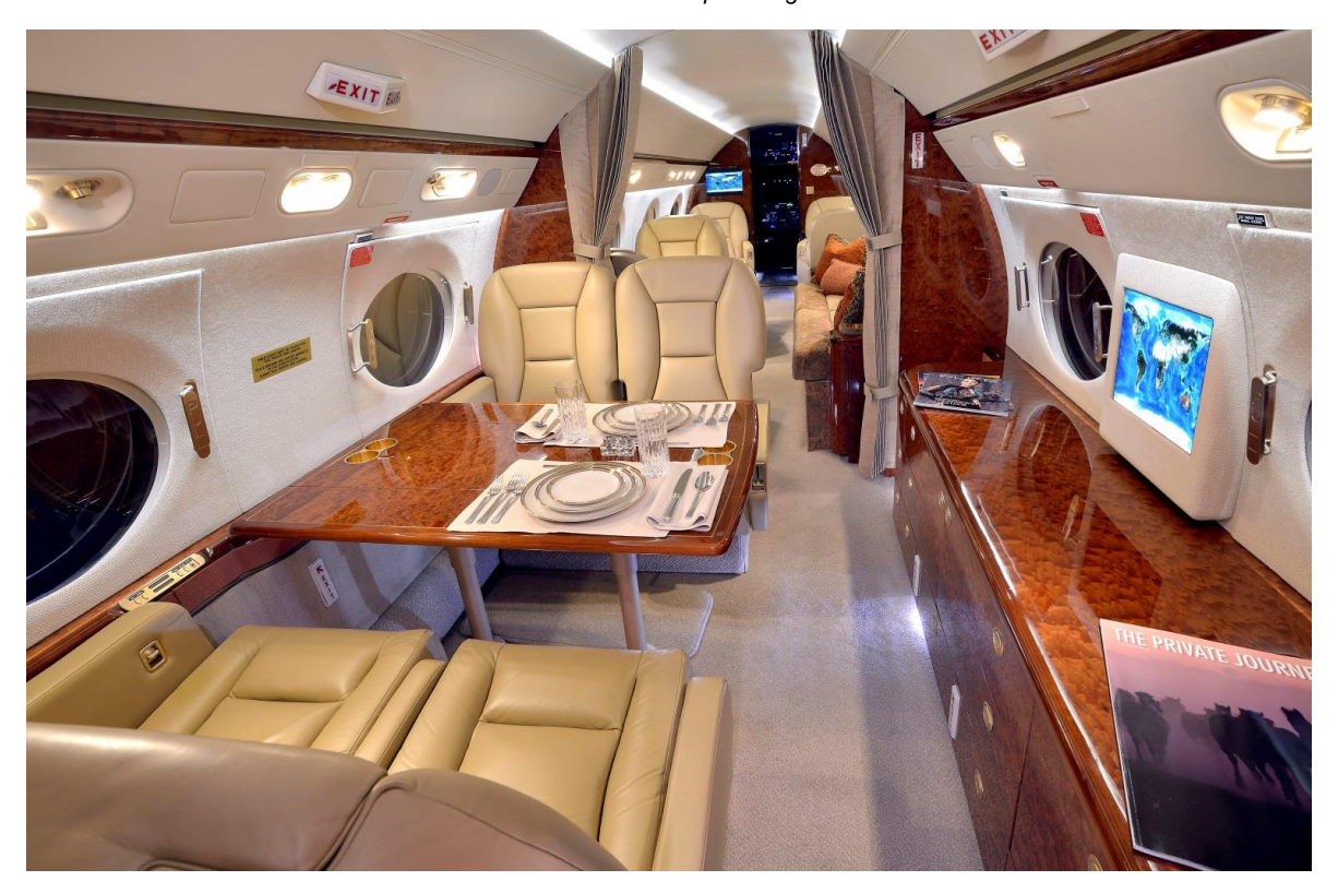
Aft Conference Group Looking Forward