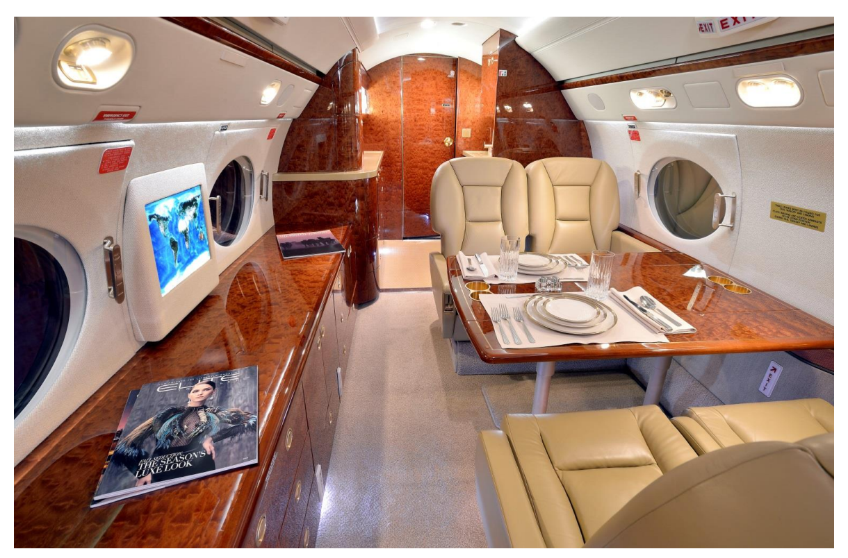
Aft Conference Group Looking Aft.