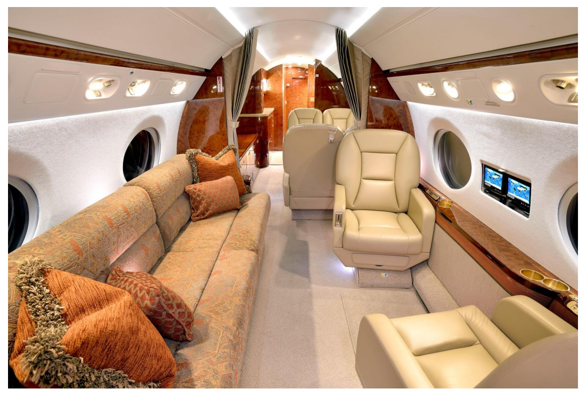
Mid-Cabin Looking Aft