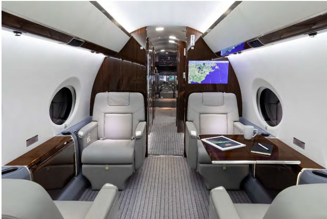
Fwd Cabin Looking Fwd