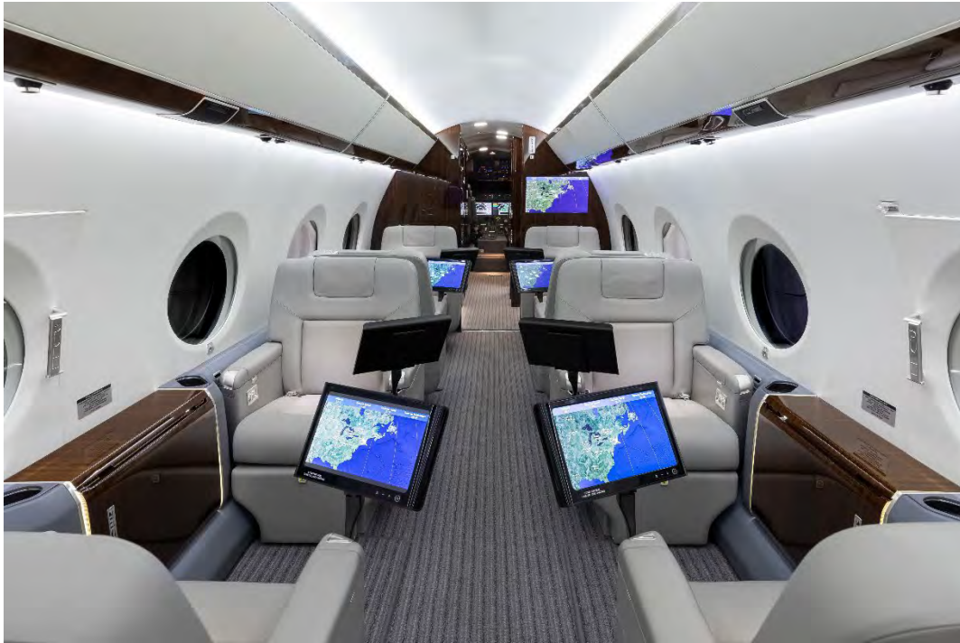
Mid Cabin Looking Fwd.