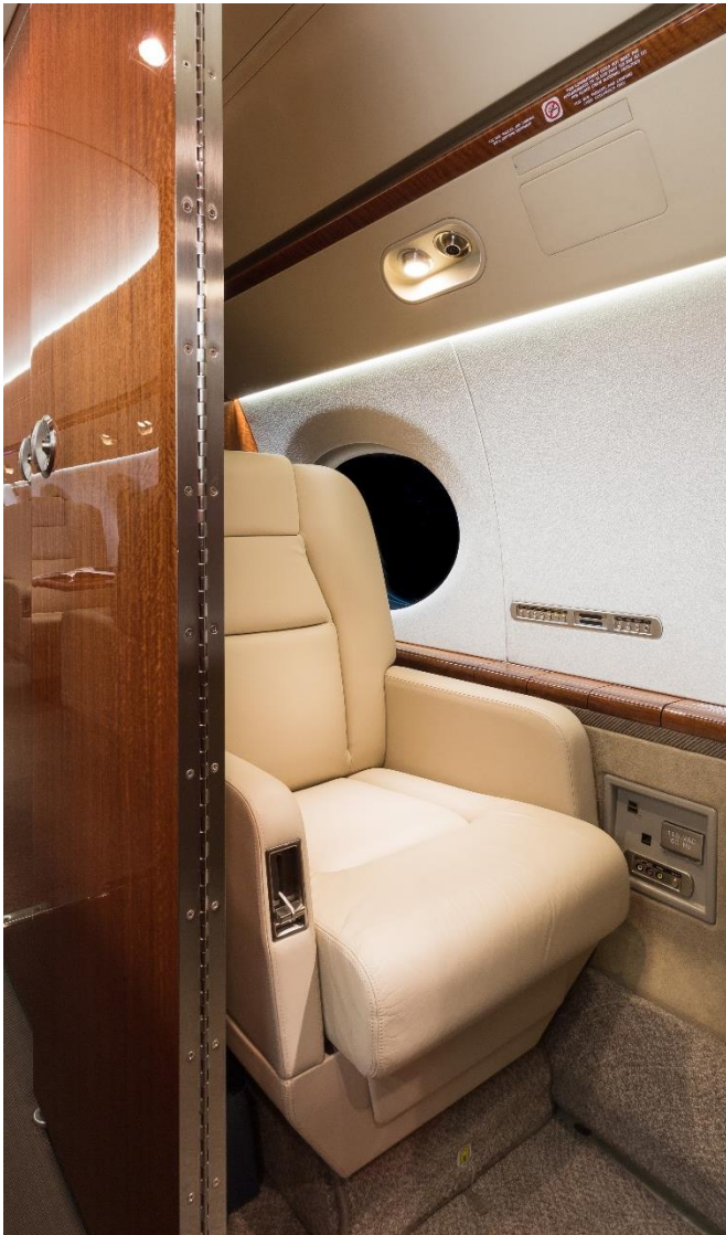
Forward Crew Rest