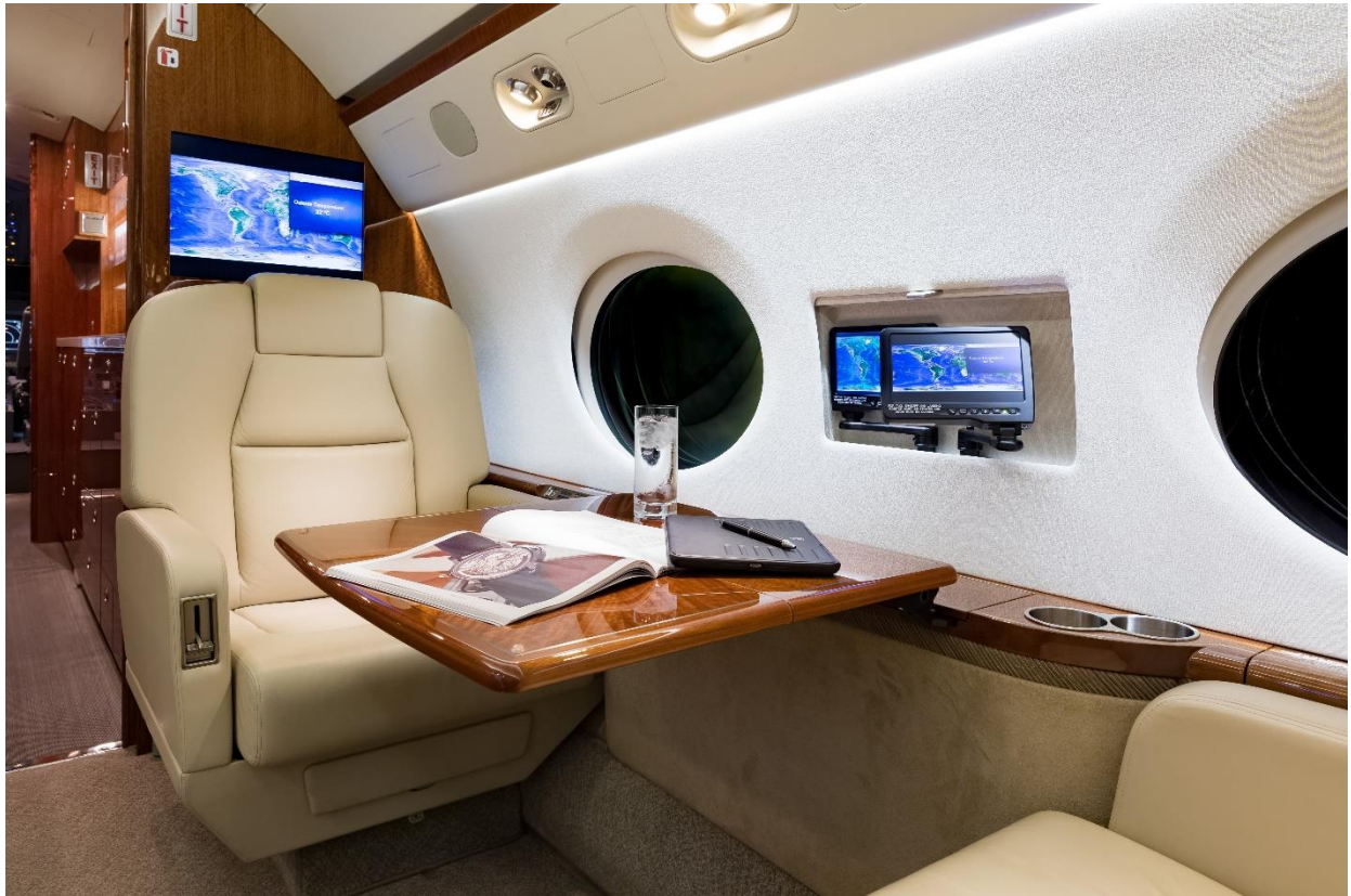
Right Hand Seat Facing Forward