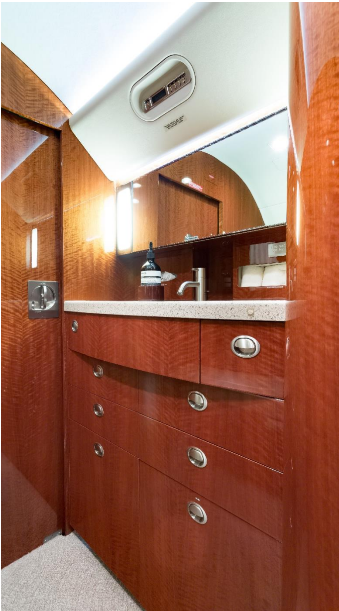
Aft Cabin Lavatory