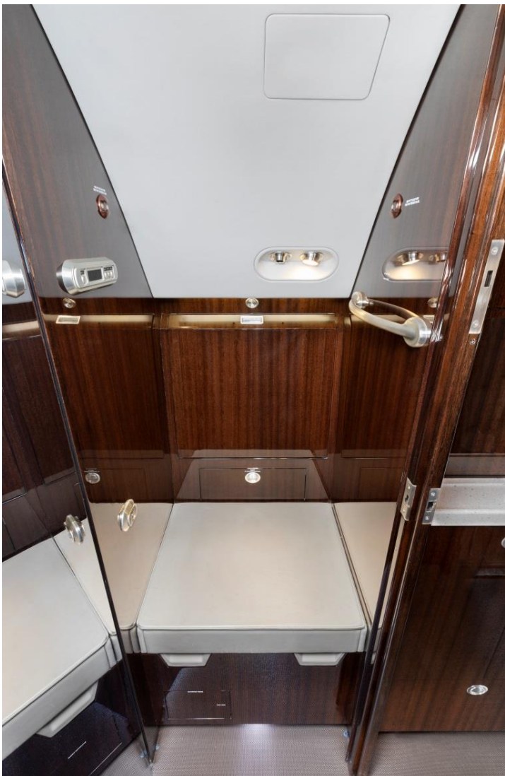
Aft Cabin Lavatory