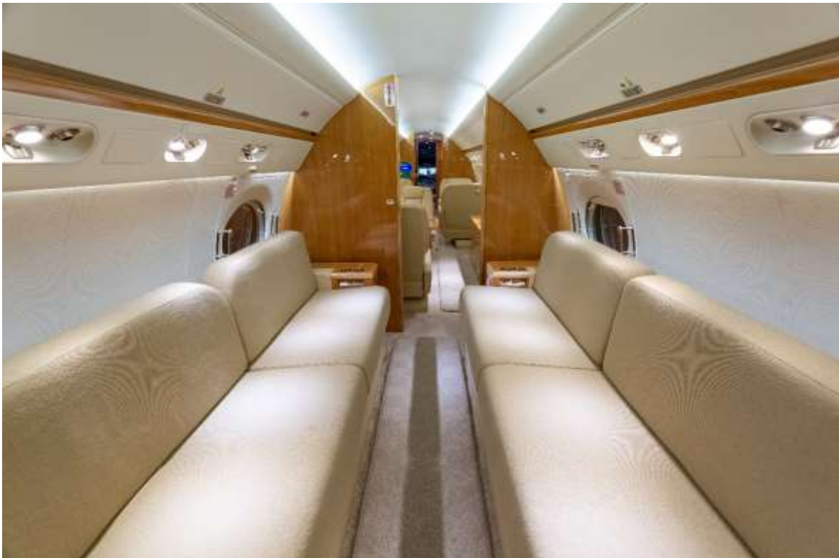
Aft Cabin looking Forward