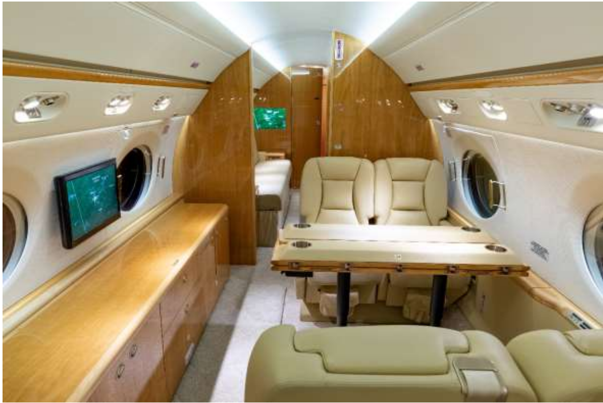
Mid Cabin looking Aft