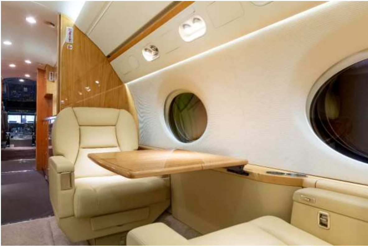
Right Hand Seat Facing Forward