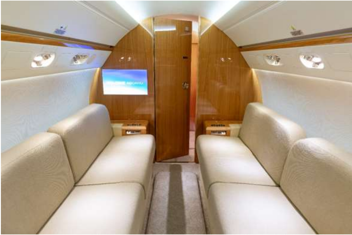
Aft Cabin looking Aft