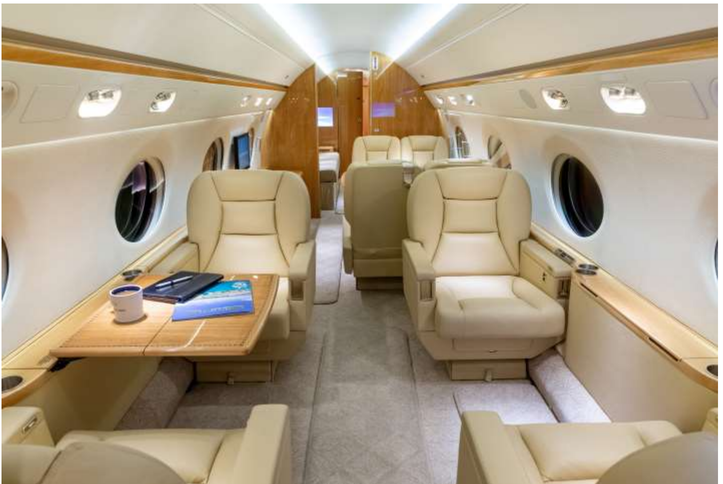
Forward Cabin looking Aft

Forward and Aft Lavatories: Forward & aft vacuum toilets with outside servicing capability