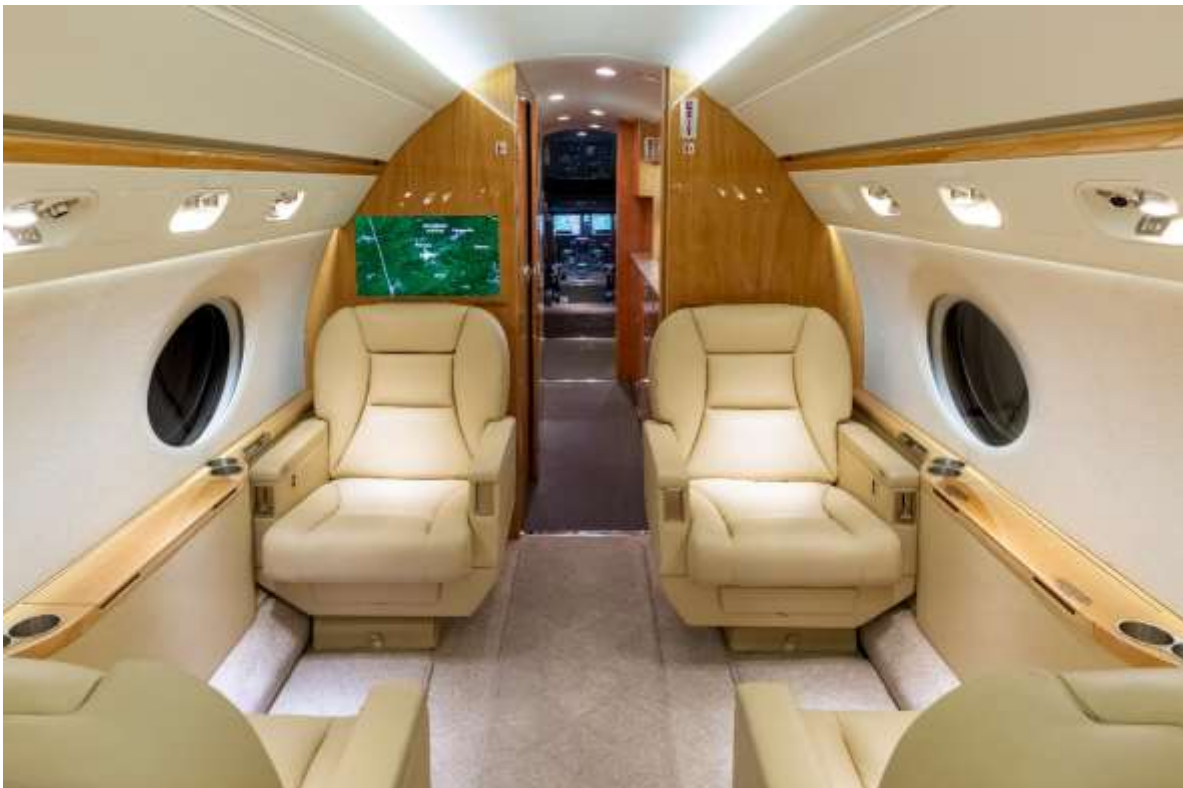
Forward Cabin looking Forward