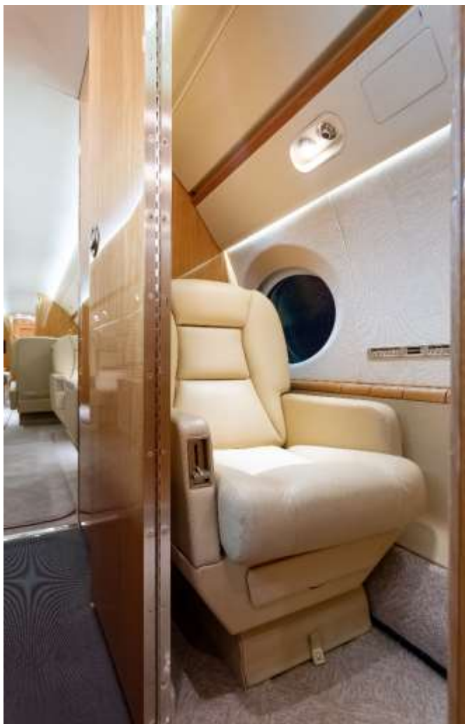
Forward Crew Rest