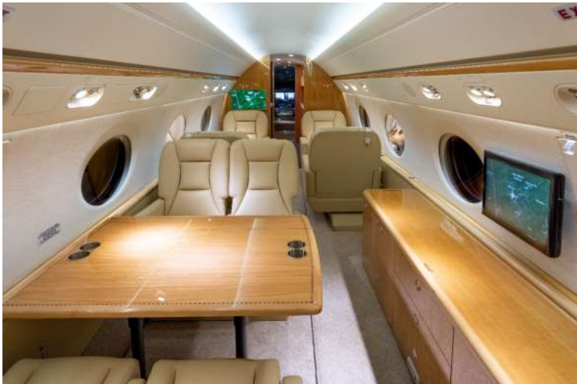
Mid Cabin looking Forward