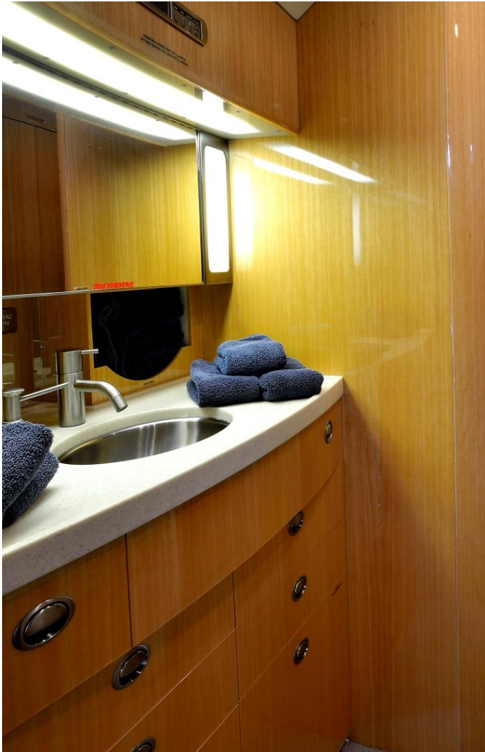
Aft Cabin Lavatory