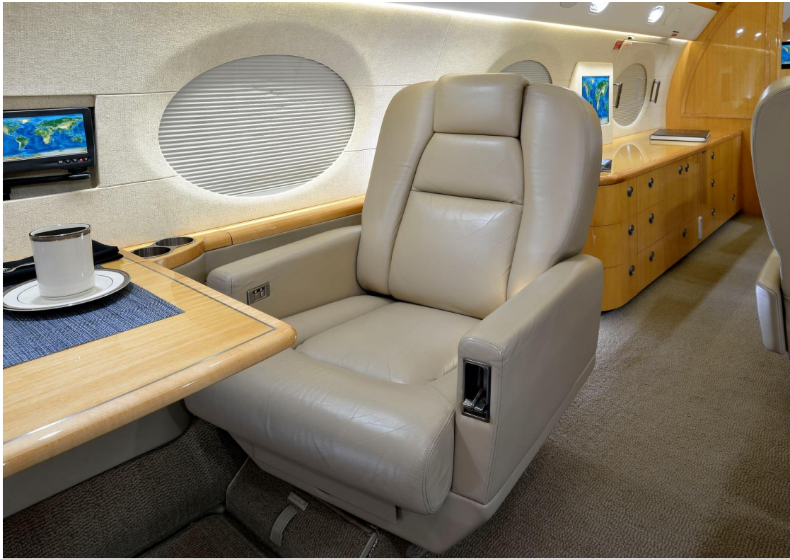
Right Hand Forward Facing Seat