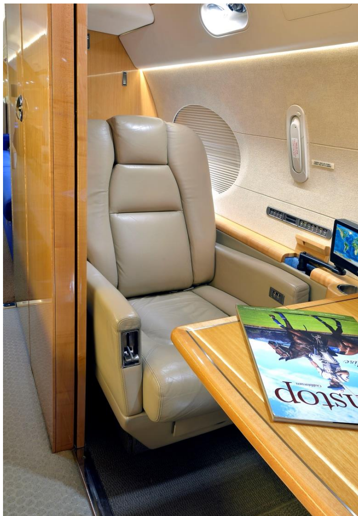
Forward Crew Rest