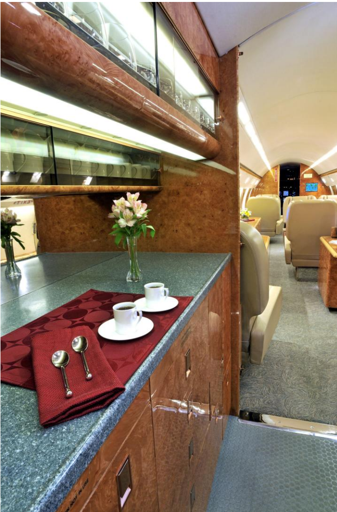
Aft Galley looking forward