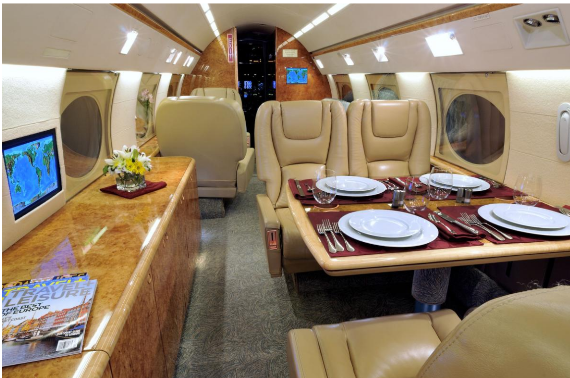
Mid Cabin Conference Group looking Fwd