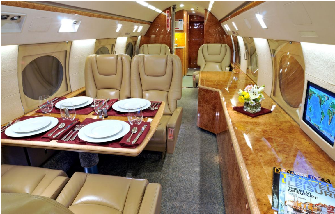
Mid Cabin Conference Group looking Aft