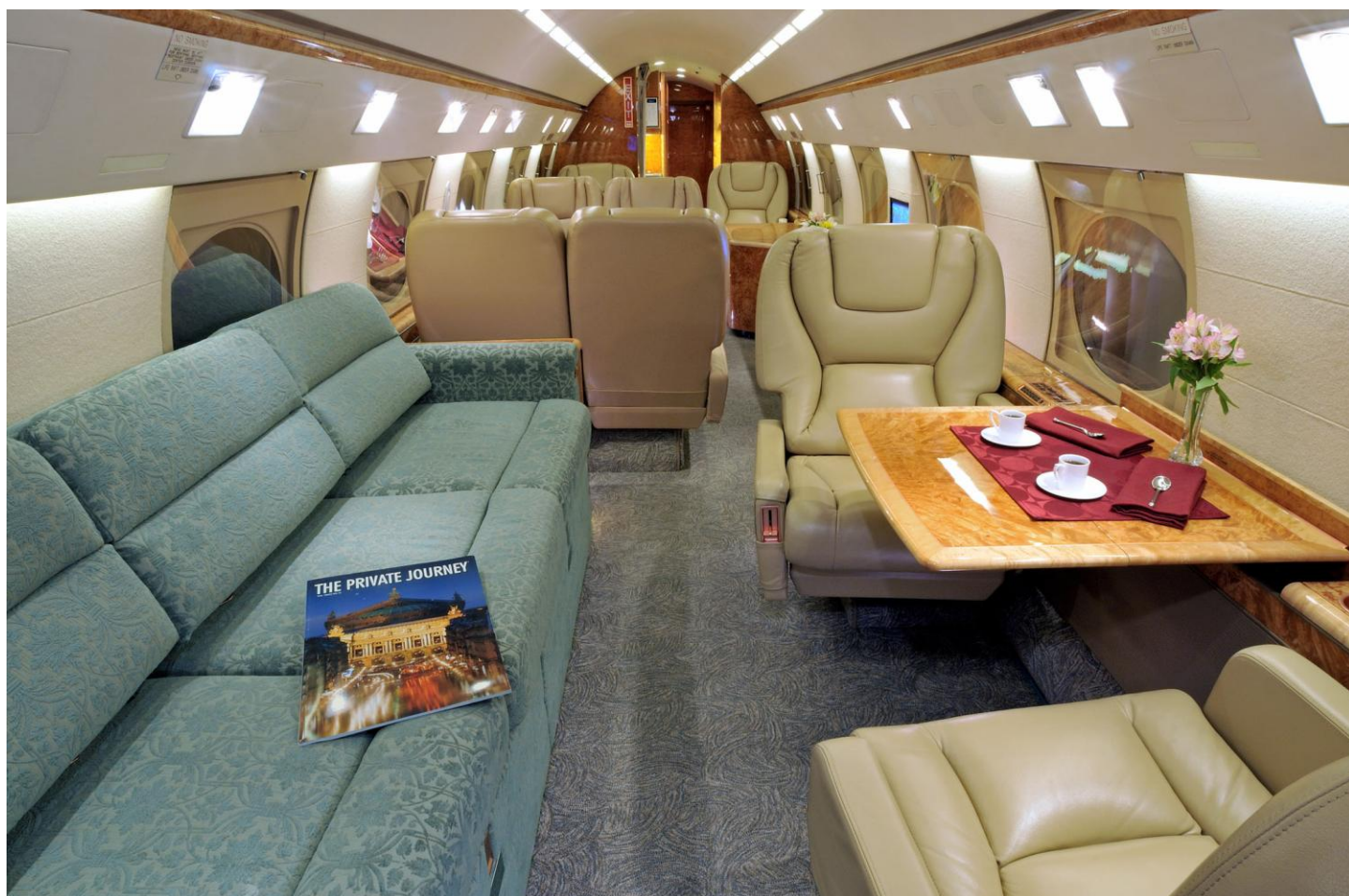
Fwd Cabin looking Aft

Elegantly appointed eleven (11) passenger floor plan features a forward cabin 2-place club opposite a 3-place divan, a right side conference group opposite a large credenza in the center section and 2 single chairs at individual work stations (with pop-up monitors) in the aft area. A fully appointed aft galley and lavatory completes the interior.