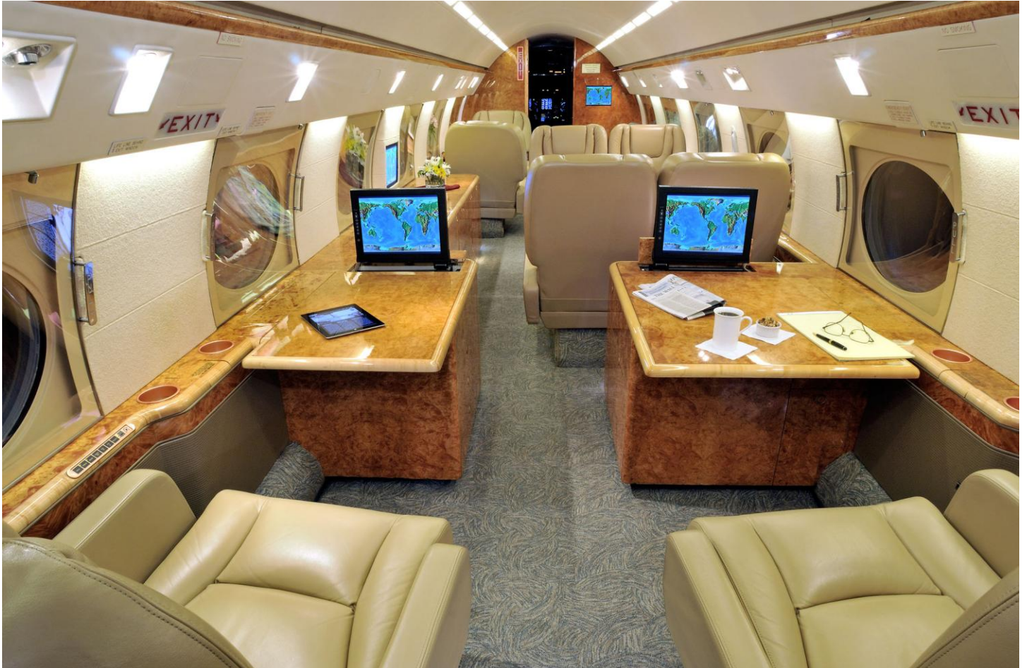
Aft Cabin looking Fwd