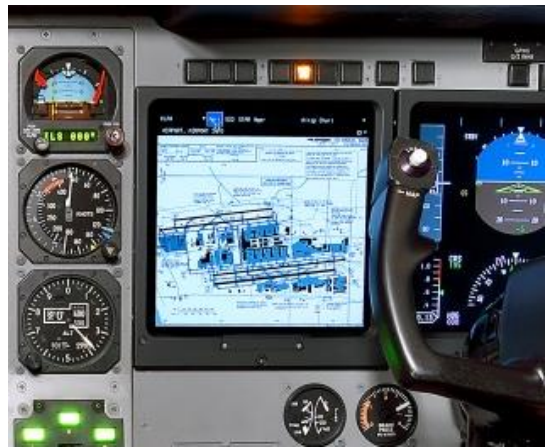
Dual Server Electronic Charts