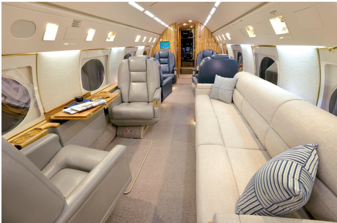
Mid Cabin looking Forward