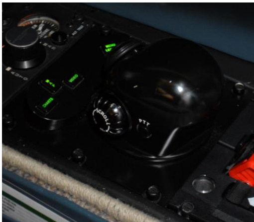
Pilot & Copilot Cursor Controller