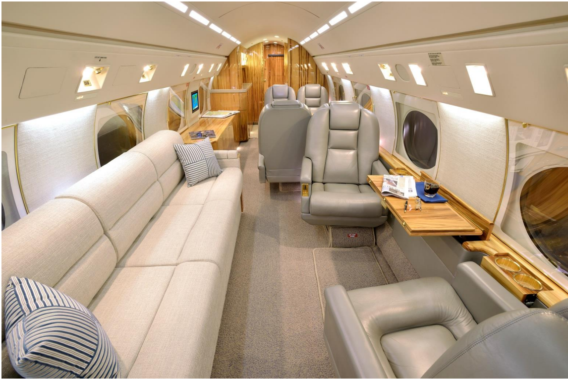
Mid Cabin looking Aft