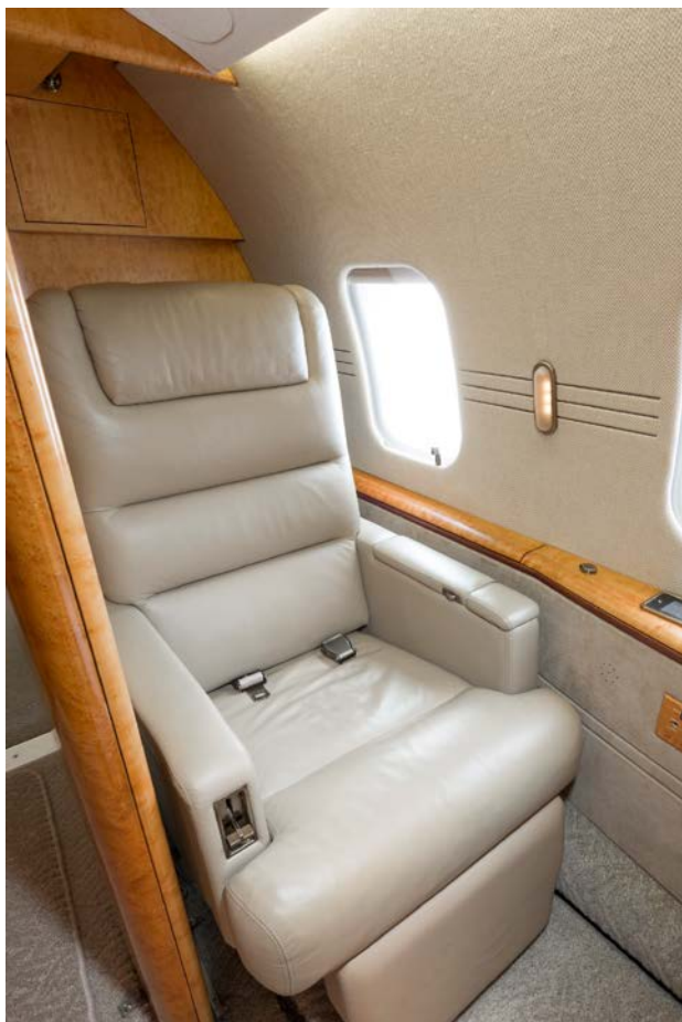
Crew Rest Area