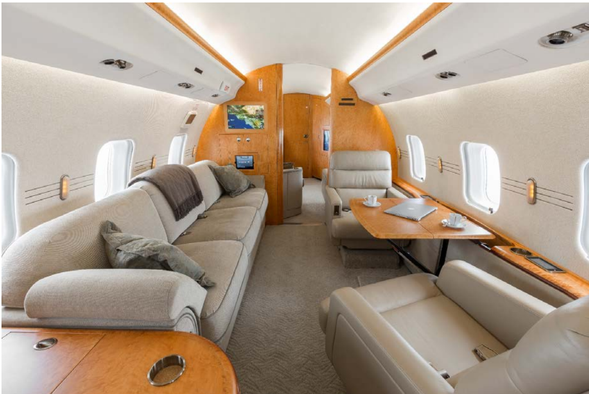
Central Living Area Equipped with Divan & Two Place Club (Configuration B – 10 Pax)