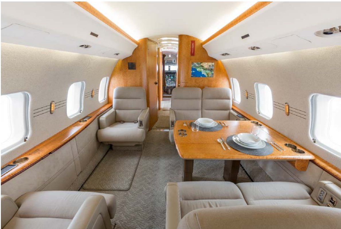
Forward Cabin Features the Dining/Conference Group and Two Place Club