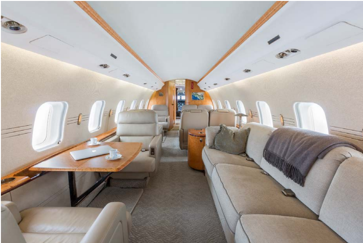
Central Living Area Looking Forward