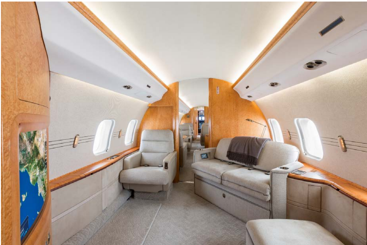
Aft State Room Looking Forward