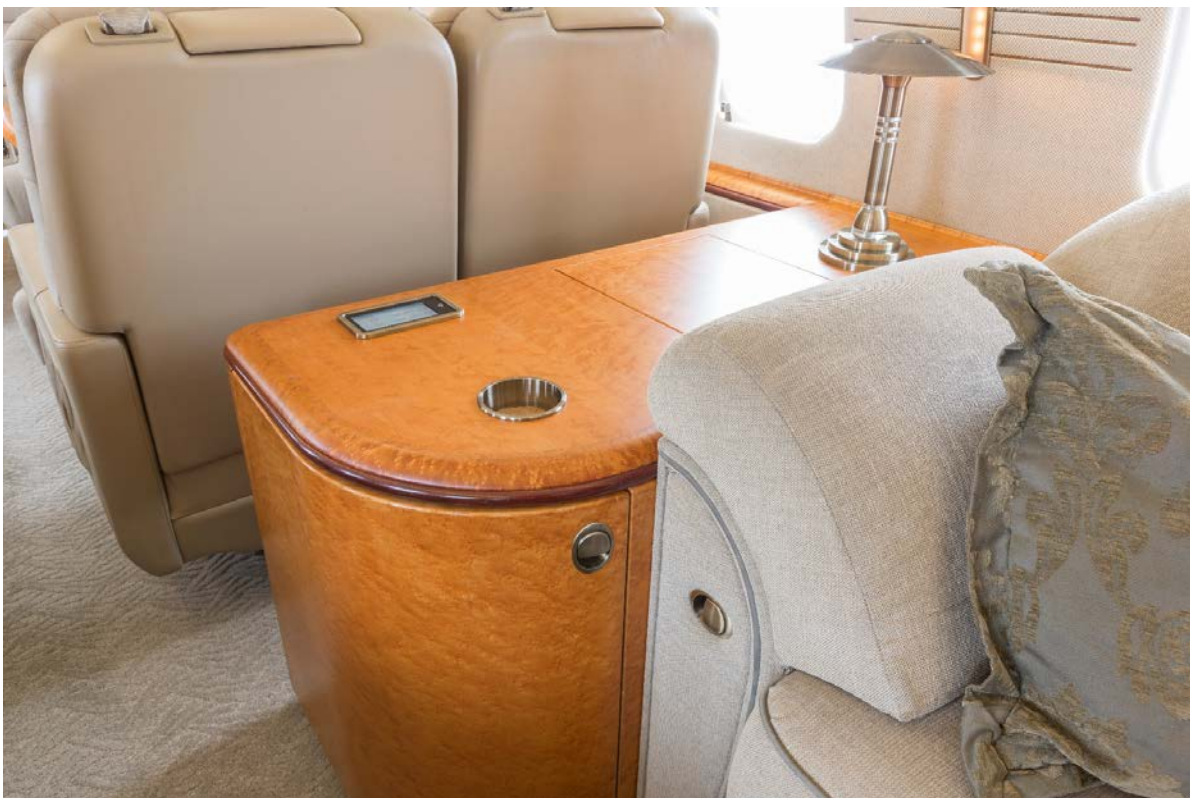
Custom Designed Interior with Curved Cabinetry