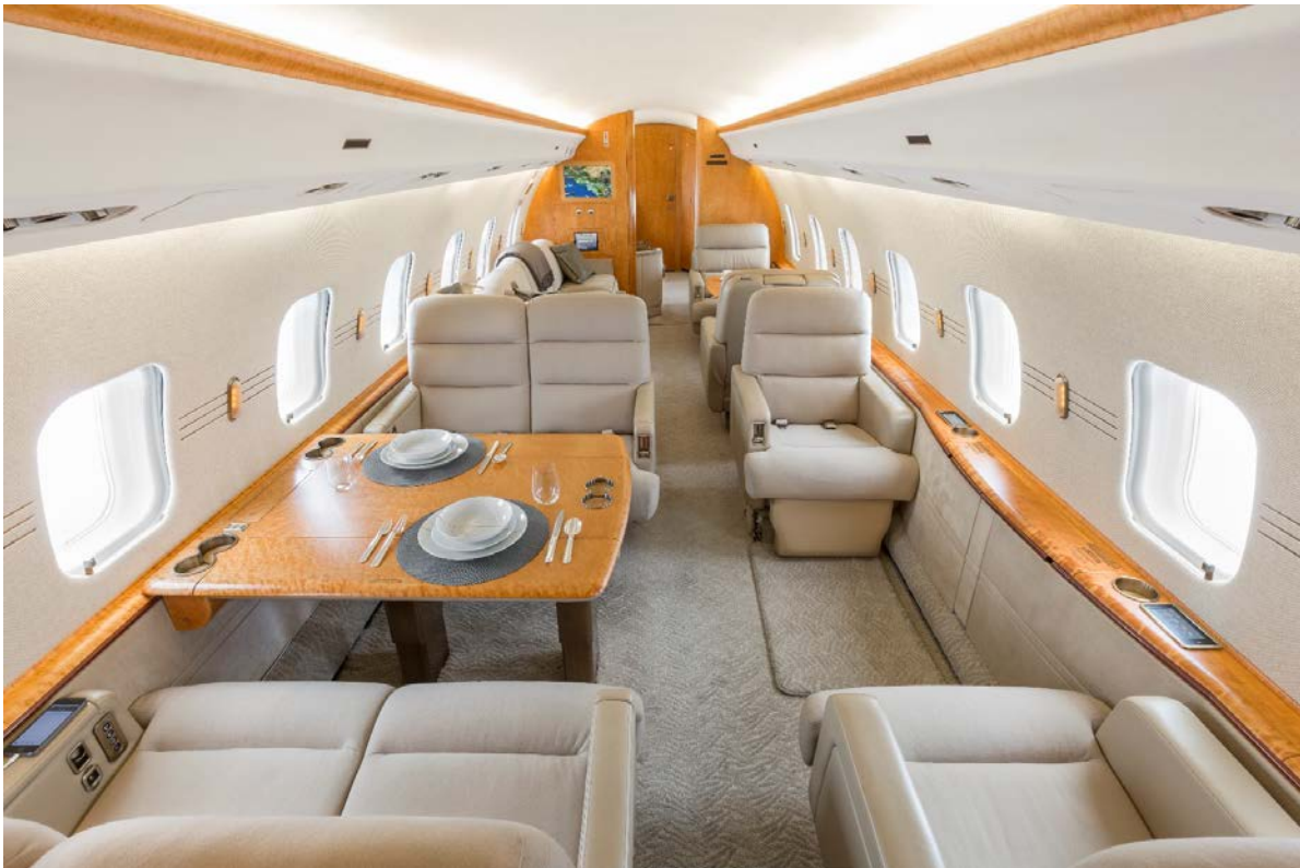
Forward Cabin Area Looking Aft