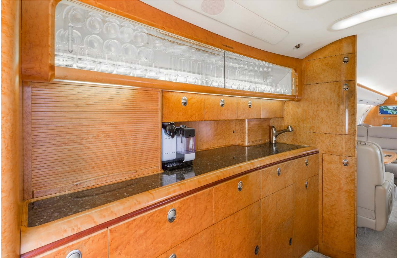
Forward Custom Curved Design Galley