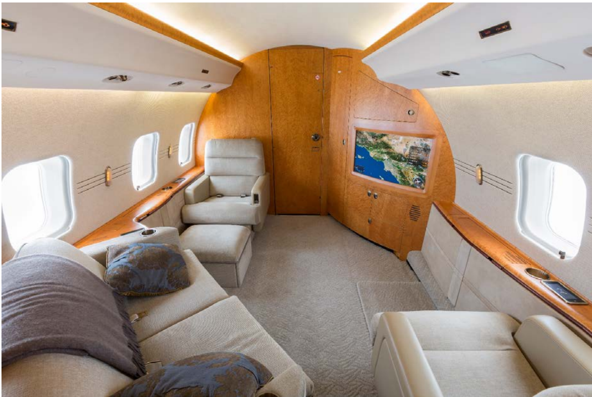
Aft State Room with Custom 32" HD Monitor & Surround Sound