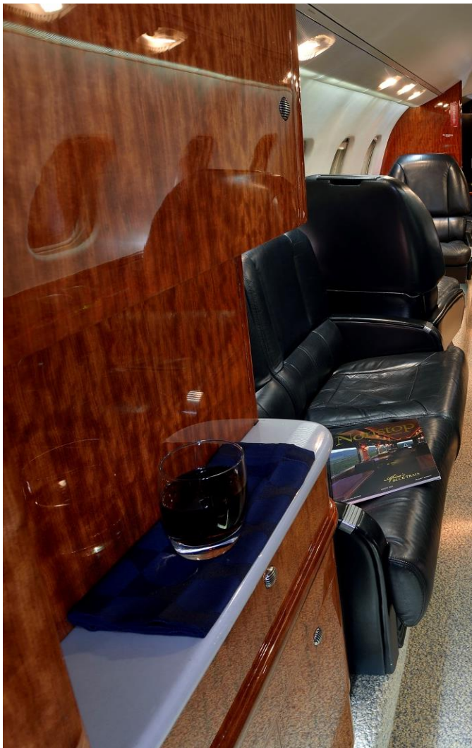
Forward Refreshment Center