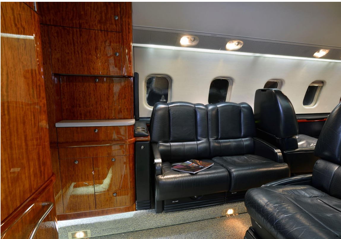
Forward Cabin From the Entrance Door