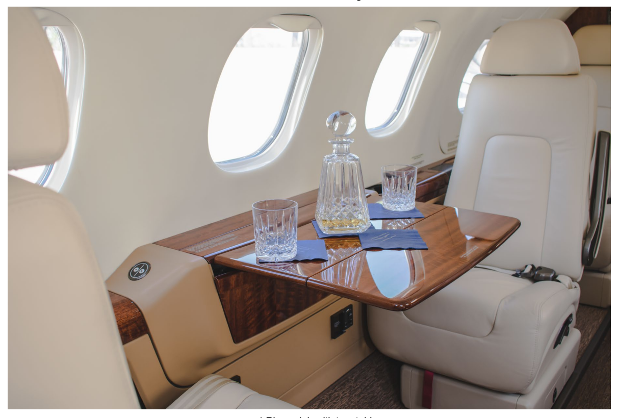
4-Place club with tray tables