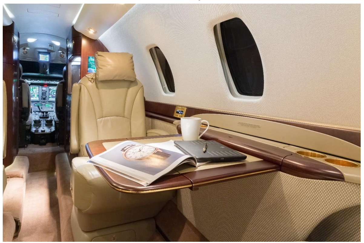
Right Hand Seat Facing Forward